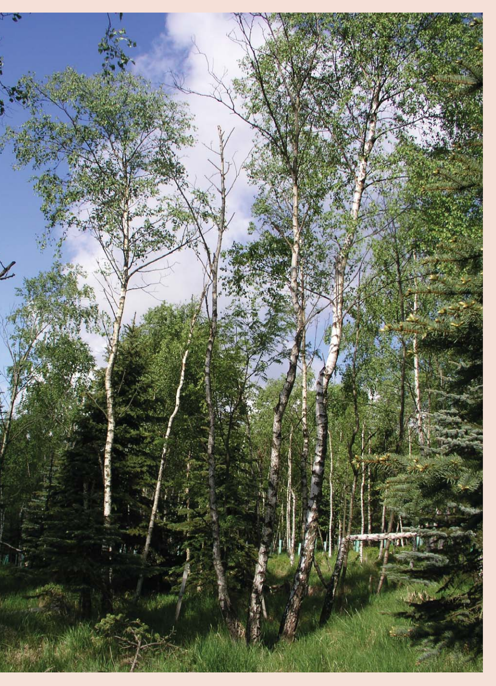
FIGURE 2 Stands of substitute tree species in the Ore Mountains are mostly composed of birch and blue spruce.

erties and low spatial dependency. Despite the radical decline in sulphur production, it is not possible to expect a rapid remedy for forest soils. Mainly due to nitrate deposition, the critical load of acid deposition in coniferous stands is currently exceeded in 87–90% of the Ore Mountains area.