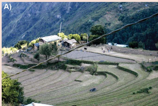
FIGURES 1A AND 1B A) Electrical lines in the foreground—a sign of ongoing rural development in Bhutan: they bring light and telecommunication to Tomijangsa, a village in Trashi Yangtse, eastern Bhutan. B) By contrast: a traditional, non-electrified kitchen in Zhemgang.

Tourism has played a key role in the economic development of Bhutan. Drawn by vast forests, rich biodiversity, and Tibetan Buddhist culture, foreign tourists pay more than US$ 200 per day to visit Bhutan, a destination in the Himalayas known for its environmental quality. More than 17,000 tourists—one for every 37 Bhutanese—visited Bhutan in 2006, providing nearly US$ 24 million in revenue. Having heard that plastic bags are banned in Bhutan, that smoking is not allowed and that 72% of the land remains under