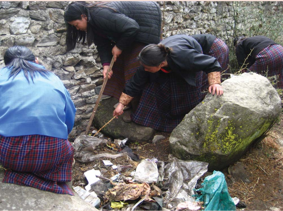
FIGURE 4 The proposed waste collection system could complement already ongoing efforts in garbage management: school girls at garbage cleanup day in Haa town.

Building on fluorescent bulb re-collection systems already in existence in the United States, through local governments and retail stores, a depot collection system is proposed for used fluorescent tube lights. While Bhutan and other mountainous developing countries lack the ease of road transport available in the US, it should be possible for them to benefit from similar collection systems, utilizing existing road and track networks, and local government infrastructure. A series of nested collection sites or depots is proposed: spent lights would be collected first at the village level, then at the county or geog level, then at the district or dzongkhag level, and finally transported to the capital, where the lights could be disposed of according to Bhutanese hazardous waste regulations, currently in development. Because the legal framework for handling hazardous and e-waste is yet to be finalized, transporting waste to Thimphu, the capital, will mean sending it to the landfill, in the short term. However, the Waste Management Act, expected to be enacted by the next session of Parliament, will provide more explicit legal guidance on the handling of hazardous and e-wastes.