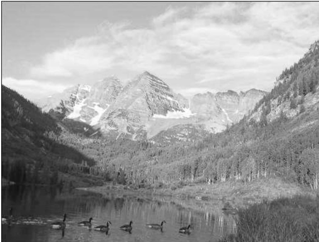
FIGURE 1 The Maroon Bells in the Elk Range near Aspen, CO, are a signature for the pristine alpine beauty of Colorado's Fourteeners. (Photo by Jon Kedrowski, August 2006)

study was performed by members of the Rocky Mountain Field Institute (RMFI) in the Sangre de Cristo Range of southern Colorado addressing the restoration efforts on Humboldt Peak (Hesse 2000). The information presented in the case of Humboldt Peak provided a good overall physical description of what is occurring on all of the Fourteeners. However, the study failed to directly address values indicating climber-visits to Humboldt Peak.