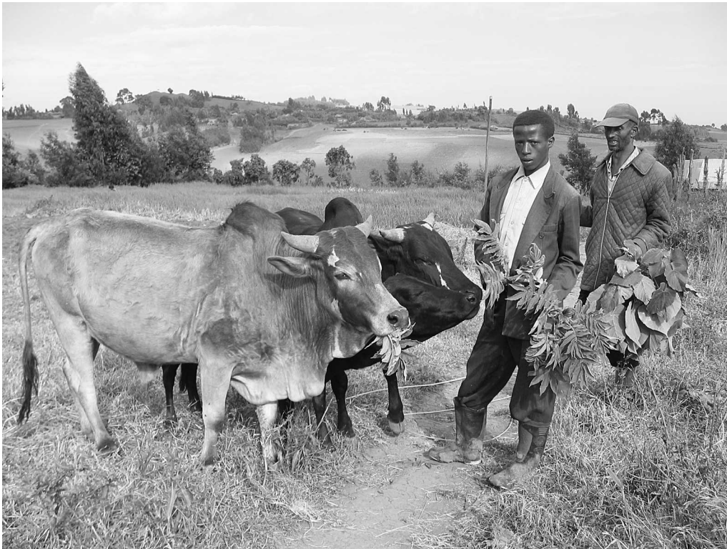
FIGURE 2 Farmers demonstrating the palatability of H. abyssinica and D. torrida at Galessa, central Ethiopia.

Ethiopia (Figure 1). The altitude ranges from 2900 to 3200 masl. The rainfall pattern is bimodal. The main rainy season is from July to September, and annual rainfall is 1399 mm. The soils are classified as Haplic Luvisols. The original vegetation in the area was mainly