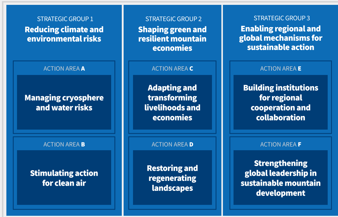
FIGURE 2 ICIMOD's 3 strategic groups and 6 action areas.