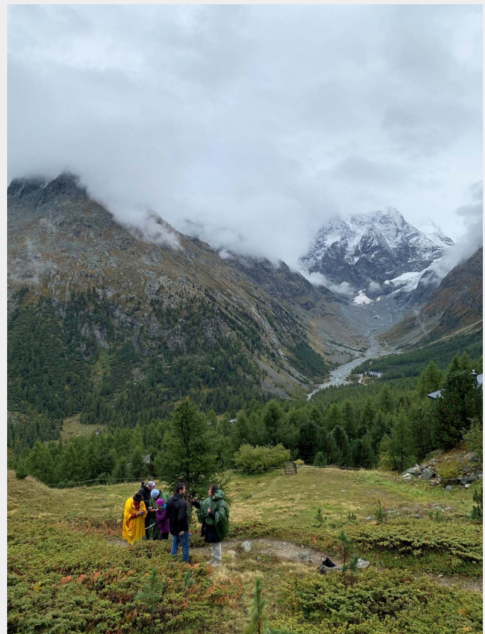
FIGURE 2 Inhabitants and researchers on a joint field campaign to measure tree growth at the upper forest limit.

context of the coronavirus disease 2019 pandemic, it was difficult to involve people in social activities. However, it was a kind of fear of doing research, collaborating with researchers,