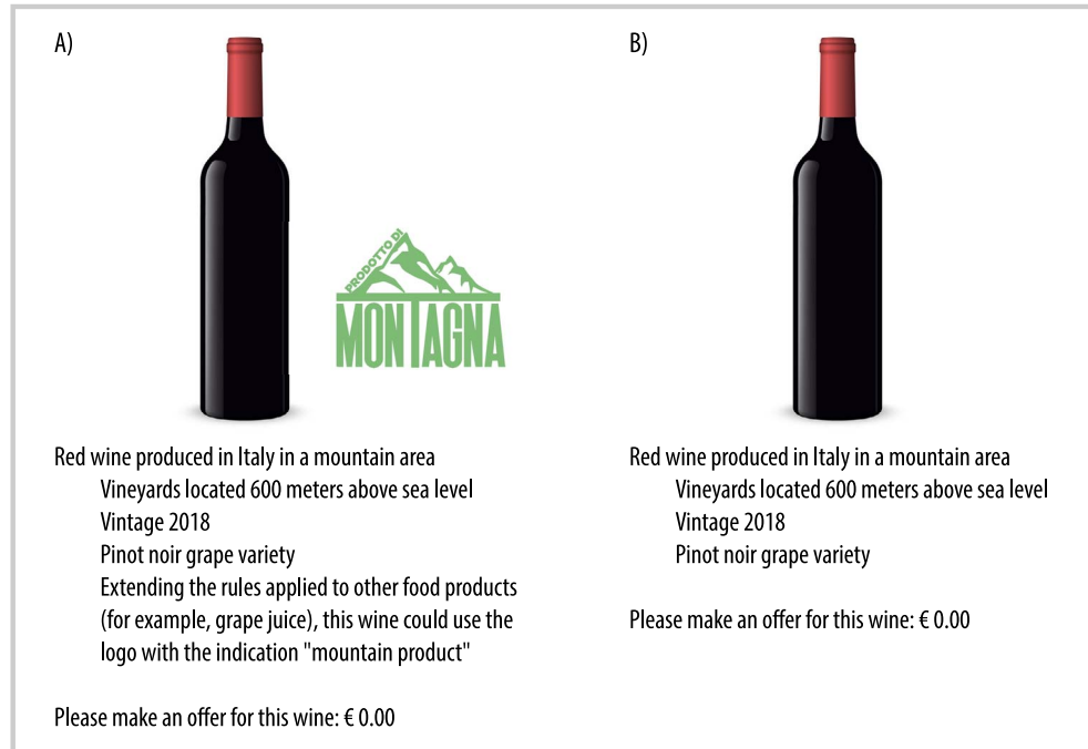
FIGURE 1 Conditions of the experiment. (A) Treatment condition; (B) control condition.

(BDM) auction (Becker et al 1964) with a sample of 273 participants from Italy (after cleaning). The online auction provider conducted quota sampling, aligned with the age distribution of the Italian population. The pretest and the auction took place in January and February 2020.