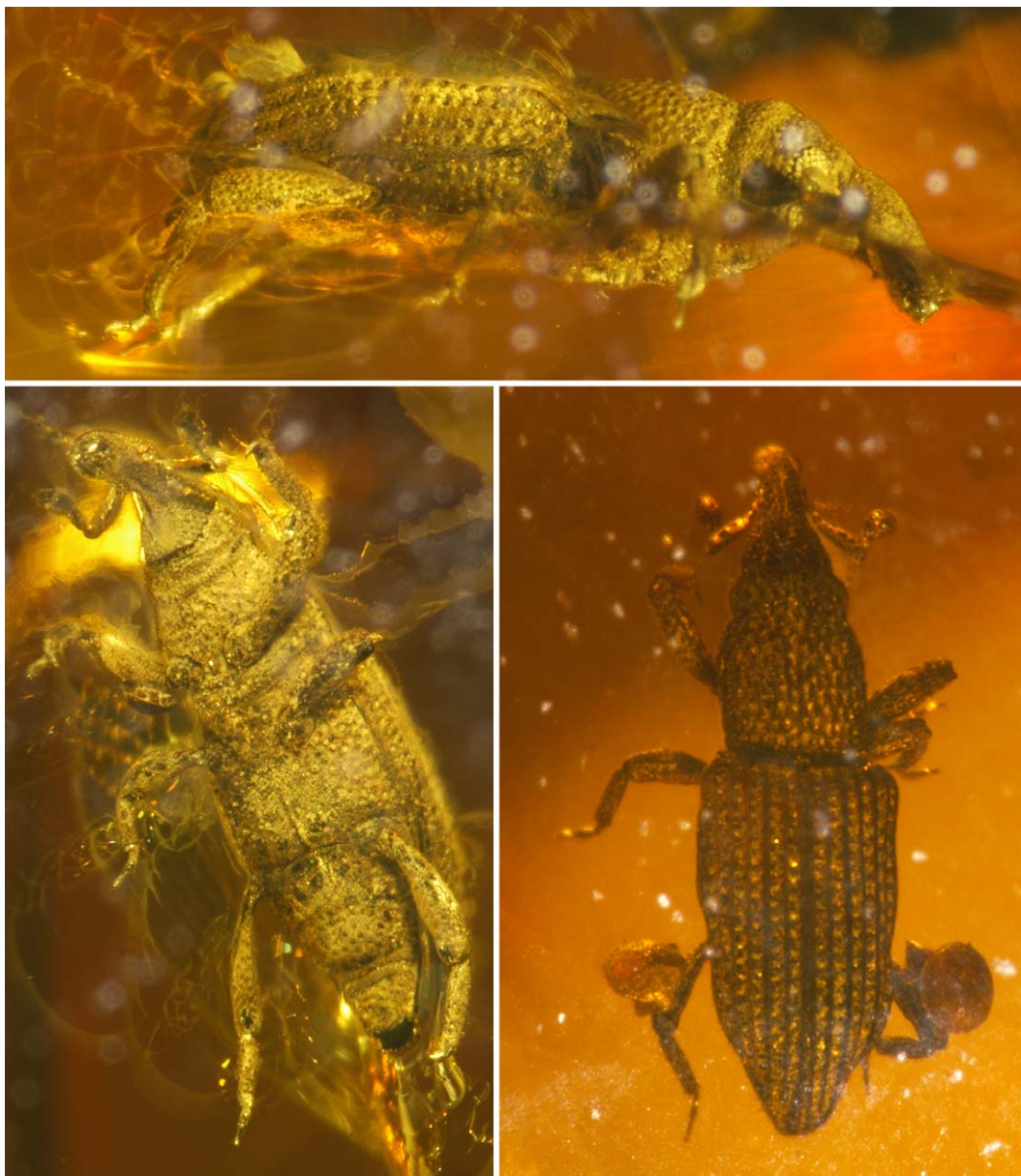
Figures 1–3. Photomicrographs of Dominican amber dryophthorine weevils. 1. Lateral aspect of holotype of Stenommatius pulvereus , new species (USNM 502681) (length of specimen 2.6 mm, including rostrum). 2. Ventral aspect of holotype of S. pulvereus . 3. Dorsal aspect of holotype of D. acarophilus , new species (USNM 502865) (length of specimen 1.9 mm, including rostrum). Arrows point out the positions of the associated mites.

material and a more definitive identification before the Baltic record can be granted any credence. Another record is a putative Dryophthorus elytron from the middle