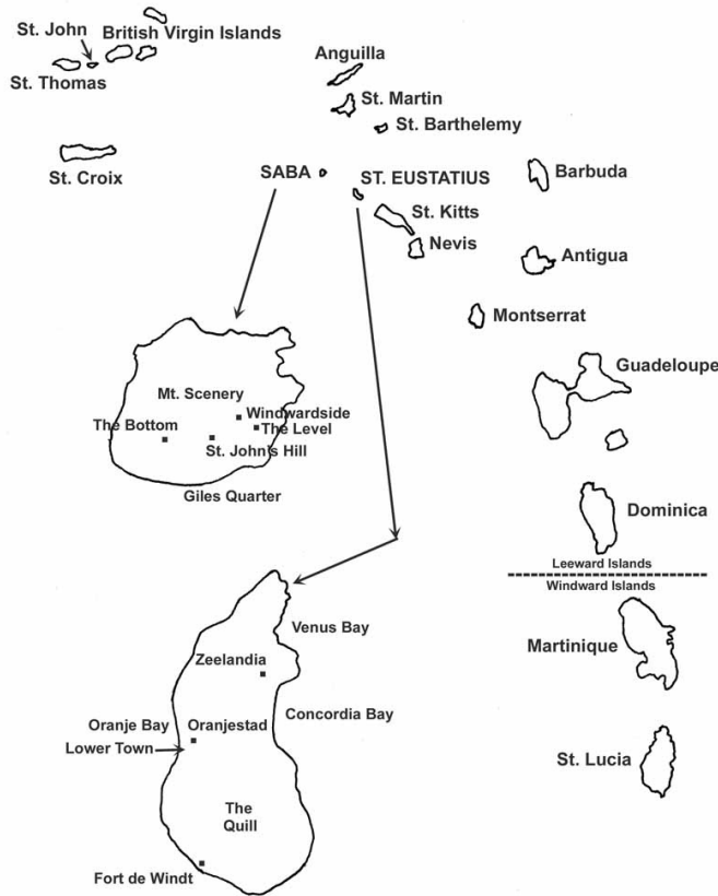
Fig. 1. Northern Lesser Antilles showing the location of St Eustatius and Saba. Insets of the islands illustrate the general collecting areas.

Additional orthopteran specimens, collected primarily in 1949 by Burgers and Hummelinck, were loaned from the Zoölogisch Museum Amsterdam (ZMA). Other specimens were obtained from the Academy of Natural Sciences of Philadelphia (ANSP) and the Zoologisk Museum, Copenhagen (ZMC). Specimens studied are deposited in ANSP, MNHN (Muséum National d'Histoire naturelle, Paris), UMMZ (University of Michigan Museum of Zoology, Ann Arbor), ZMA, and ZMC.