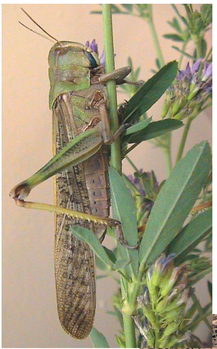
Fig. 1. Above, adult Asian migratory locust. B. Right, hopper band of 5th instar nymphs of LMI. See also PLATE IV.

are used for characterizing the risks of habitat susceptibility to locust infestation, and for planning insecticide control operations. Subsequently, the reed stands with high risk of locust infestations are treated with pyrethroid and organophosphate insecticides, which are applied primarily as aerial sprays. The goal of the locust management program in the Amudarya delta is to treat nymphal bands in order to prevent swarm migration into the adjacent agricultural fields