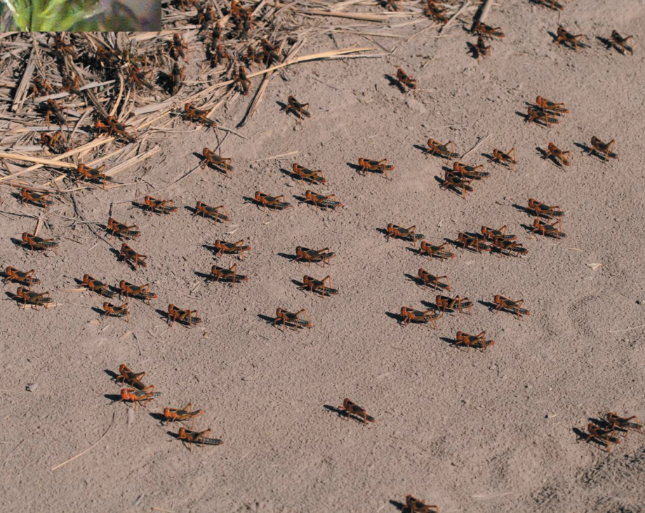
JOURNAL OF ORTHOPTERA RESEARCH 2007, 16(2)

Based on the subjective risk estimates, thousands of hectares are treated with broad-spectrum insecticides with dire consequences for nontarget organisms in the fragile delta ecosystem (Latchininsky & Gapparov 1996). At the same time locust infestations in many undersurveyed areas often remain untreated, which leads to swarm formation. The swarms are known to create havoc not only in the adjacent crop areas, but in those situated far from the delta.