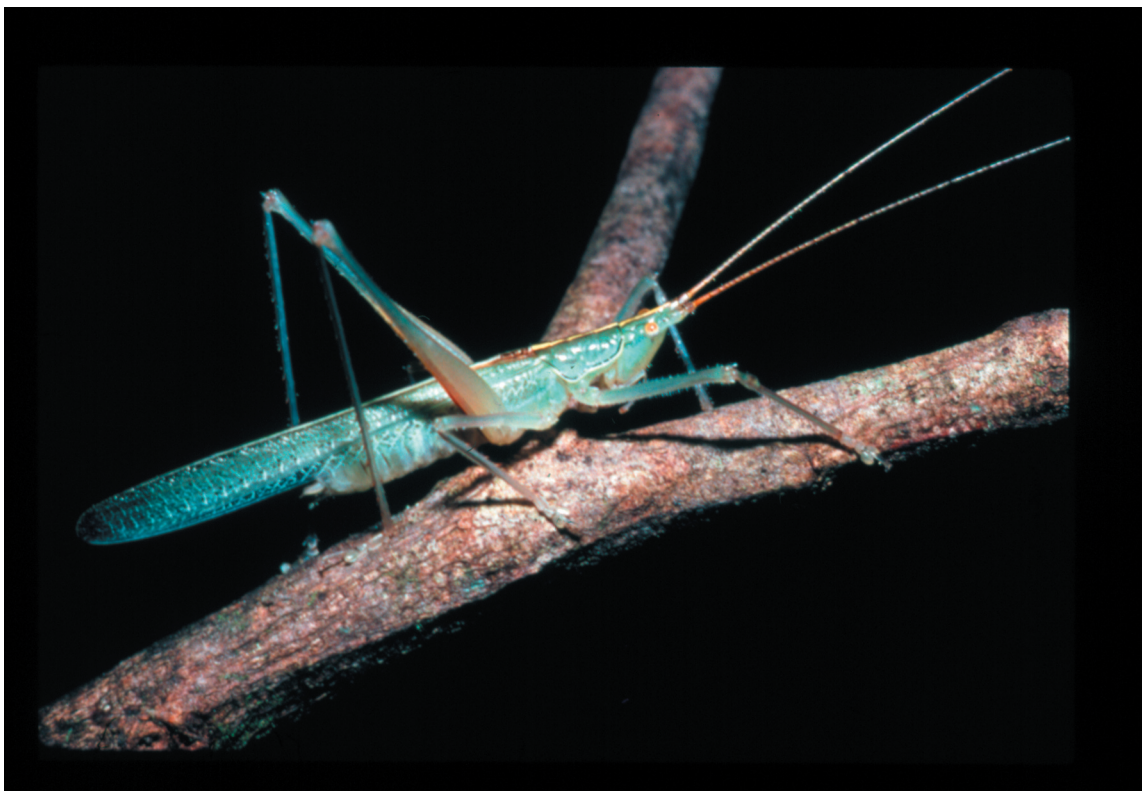
Fig. 21. Graminofolium castneri Nickle, new species, green form. See also PLATE V.