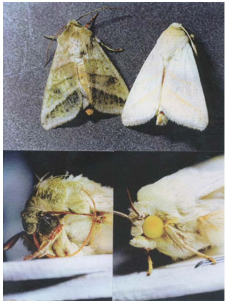
Figure 1. Mutants of scale color and eye color in Heliothis virescens ; Upper left: wild type scale color (green); Upper right: mutant scale color (yellow); Lower left: wild type eye color (grey); Lower right: mutant eye color (yellow).