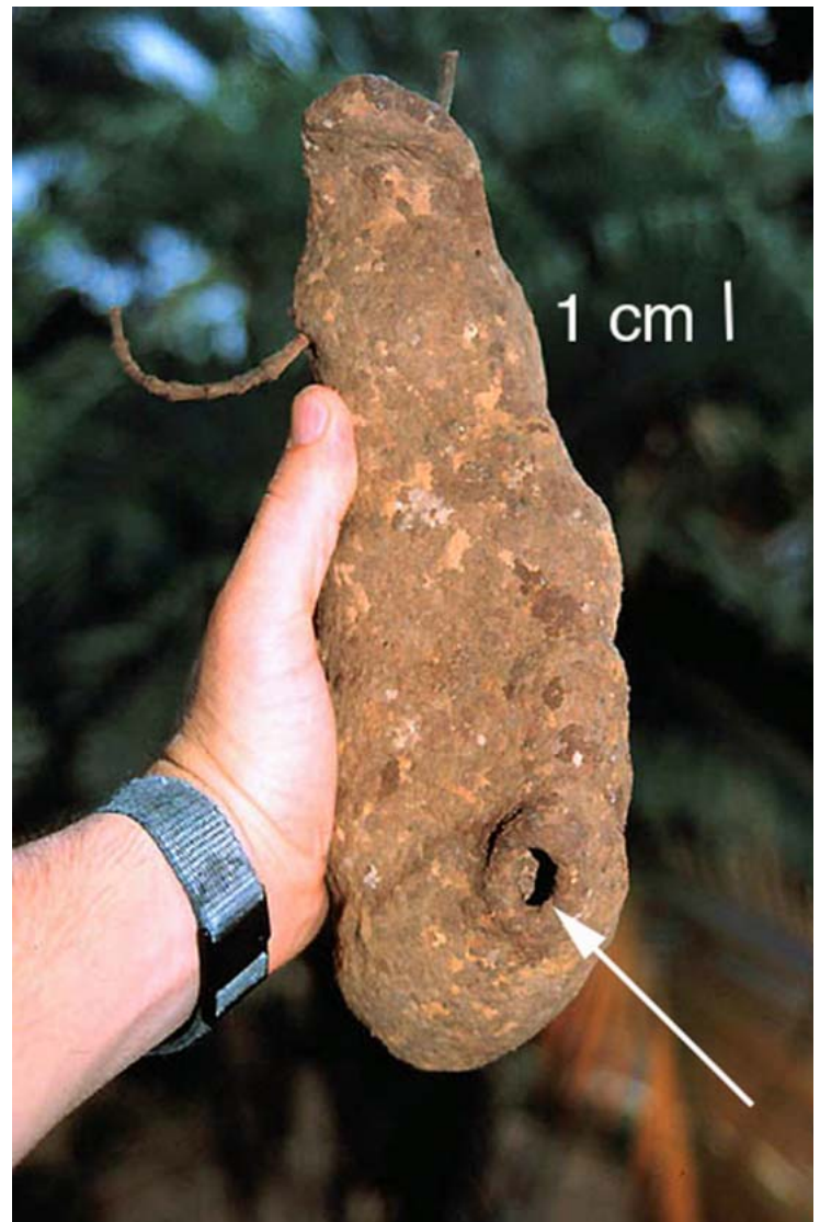
Figure 1. Photograph of a mud nest of Polybia emaciata collected July 1998 in Gamboa, Panama. Note the single entrance hole (indicated by the arrow).

Polybia emaciata only rarely (5 occasions out of 40 trials on the observation nests and 2 occasions out of >15 trials on in situ nests) exhibited a typical Polybia attack response within 30 sec when the nest was tapped. Polybia emaciata workers never rushed out of the nest and onto the nest envelope. In all trials where the wasps did not attack in response to the initial mechanical disturbance (within the first 30 sec), some of the workers on the nest surface flew off the nest and departed; the remainder rapidly entered the nest. After the initial disturbance, the nest surface and the lowest layer of comb