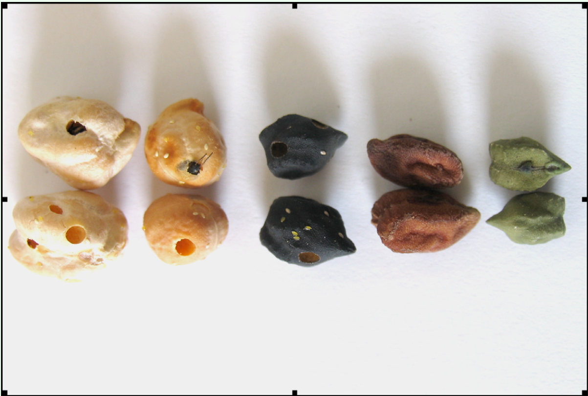
Figure 1. Adult emergence holes and eggs of Callosobruchus maculatus on seeds of two 'kabuli' and three 'desi' chickpeas (from left to right).

so as to avoid the escape of C. maculatus adults, and provide air circulation. The insects were allowed to remain there for the purpose of oviposition for one week, and were then removed. The genotypes were examined on biweekly basis to record the number of damaged seeds per genotype by visual observation. Damage to seeds by C. maculatus was manifested by the round exit holes with the 'flap' of seed coat made by emerging adults (Figure 1)