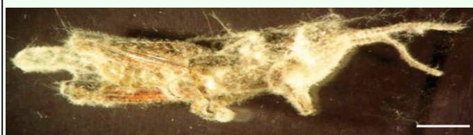
Figure 3. Fusarium verticillioides on third-instar nymphs of Ronderosia bergi 48 h after death. Scale bar: 14 mm. High quality figures are available online.

The means by which the infection of T. collaris and R. bergi by F. verticillioides might have been effected is not clear, but Kilpatrick (1961) stated that the entry of the fungus into the insect could occur via the oral route, oviposition tubes or wounds.