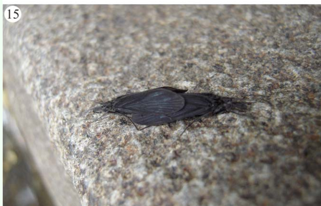
Figures 14-15. Some caddisflies specimens of Itatiaia massif. (14) Macrostemum sp. (Hydropsychidae); (15) Chimarra sp., mating (Philopotamidae). Pictures 14 and 15 – Daniela Maeda Takiya. High quality figures are available online.

preserved in 80% ethanol and few ones were pinned.