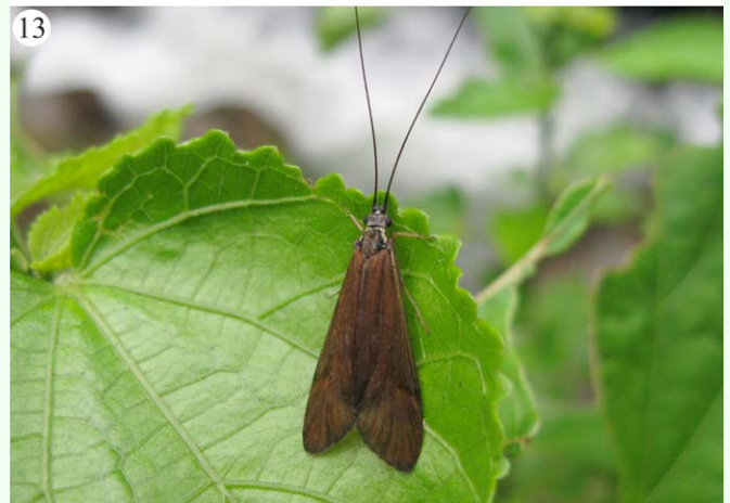
Figures 12-13. Some caddisflies specimens of Itatiaia massif. (12) Hydropsychidae; (13) Centromacronema auripenne (Rambur) (Hydropsychidae). High quality figures are available online.

includes data of Itatiaia massif is also included here to complement this inventory.