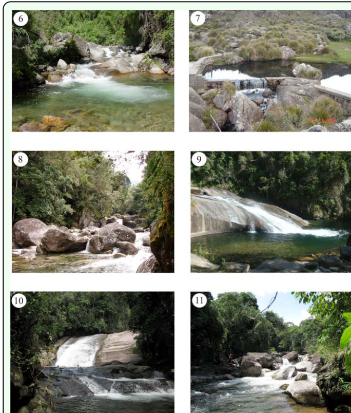
Figures 6-11. Rivers and streams of Itatiaia massif. (6) Rio Aiuruoca; (7) Rio Campo Belo dam at higher portion of PNI; (8) Rio Campo Belo; (9) Rio Preto, Escorrega do Maromba; (10) Rio das Pedras, Cachoeira de Deus; (11) Rio do Salto. High quality figures are available online.

Mantiqueira) which provides an ecological buffer zone for the park (Figure 5).