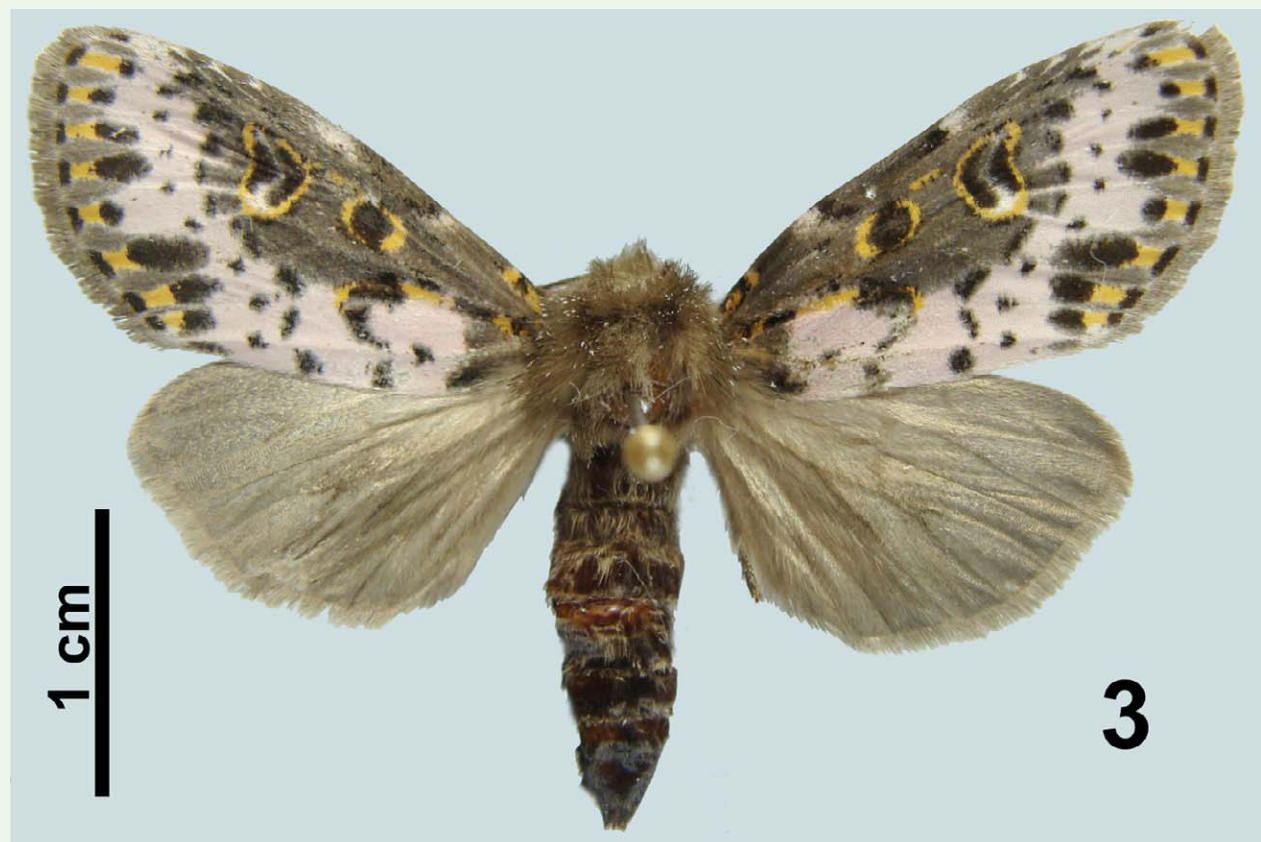
Figure 3. Adult of Xanthopastis timais .