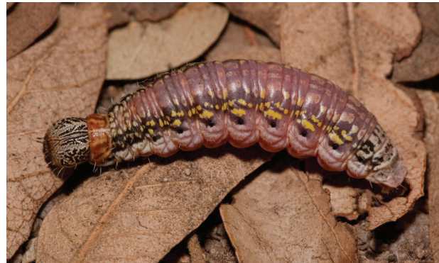
FIG. 10. Prepupal Lacosoma arizonicum larva, USA, AZ, Cochise County, Huachuca Mountains, Miller Canyon, 5.X.2012, 4 cm in length.

We have not observed prepupal larvae directly because the larvae that survived to this stage remained within their larval shelters up until and during the pupal stage. However, Charles W. Melton provided photos (one shown in Fig. 10) of what we deduce to be a prepupal larva. This inference is based on the darker than usual coloration, wandering behavior as evident by the observed behavior of this individual being found crawling on the ground in an oak woodland, and the late season record: 5.X.2012 (C. Melton pers. comm.). The photo shows a larva similar to the one that we figure in Fig. 6, but more purple in coloration and fully fed. The purple hue is most obvious on the abdominal segments except A8–A10. Considering that this apparently prepupal larva was found in the absence of its larval shelter, we recognize the possibility that L. arizonicum