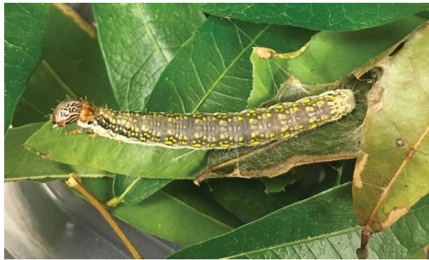
FIG. 9. Final instar Lacosoma arizonicum feeding on Quercus virginiana in captivity, displaying fully extended body, reared ex. wild-collected southern Arizona, USA.

Coloration of the final instar is diagnostic, but with slight variation in the expression of yellow, as well as the degree of development of the broken longitudinal stripes (compare Figs 6 and 7). The thin middorsal stripe is usually continuous (especially anteriorad); there are three splotchy stripes, one subdorsal, and two supraspiracular. The yellow markings contrast with the dirty- to red-brown ground color. The thorax and abdomen are pale and mostly unmarked below the spiracles. The middorsal stripe divides the light red-brown prothoracic shield. The rugose head (Fig. 8) is handsomely patterned with silver-gray protuberances, giving way to black bars and lines above the level of the frons. The primary setae are white, peg-like, and somewhat widened apically. Middle and penultimate instars (Fig. 5) are similar to the final instar, but browner overall, with more subdued markings. Mature larvae are approximately 3–4 cm in length, but may stretch themselves to almost twice in length when extended from their shelters during feeding (Fig. 9).