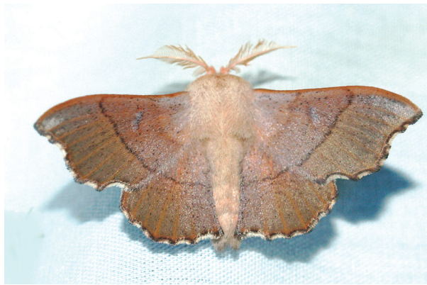
FIG. 13. Adult male Lacosoma arizonicum , USA, Arizona, Cochise Co., Ramsey Canyon, Nature Conservancy Preserve. 3.VIII.2012.

the first week of October 2016. After the adult fly emerged from its puparium, it was killed and deposited in the Canadian National Collection of Insects, Arachnids and Nematodes, Ottawa, Ontario, Canada (CNC). James O'Hara (CNC) identified the tachinid specimen as a Lespesia species, possibly undescribed. This represents the first record of a parasitoid from L. arizonicum . The Janzen Costa Rican parasitoid database has records of Lespesia parasitizing Mimallonidae in the genera Druentica Strand, 1932 and Trogoptera Herrich-Schäffer, [1856] (Janzen and Hallwachs 2017).