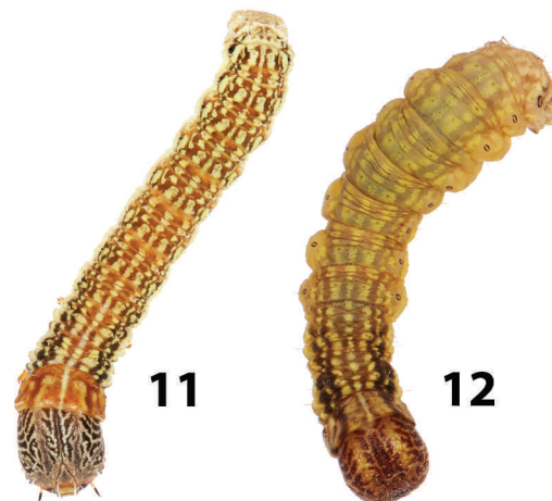
FIGS. 11, 12. Comparison of North American Lacosoma species. 11. L. arizonicum , freshly molted final instar, captive reared ex. wild collected southern Arizona, USA. 12. L. chiridota , mature final instar, captive reared ex. female Austin Cary Forest, Alachua County, Florida, USA. Not to scale.

Parasitoid: Of the eight L. arizonicum larvae originally collected by RAS, five perished, two resulted in either an eclosed adult or a (presently, at time of writing) diapausing larva, and one penultimate instar produced a single tachinid parasitoid that pupated after