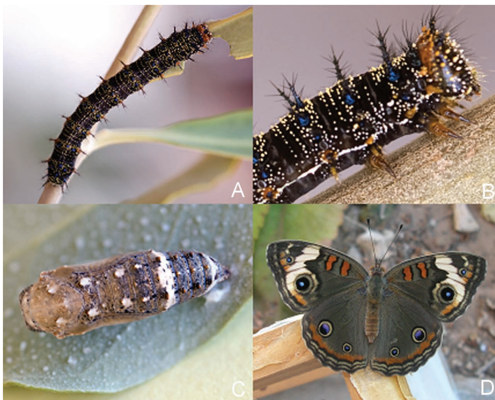
FIG. 2. Developmental stages of Junonia genoveva from Estero del Soldado. (A) last instar larva feeding on its host plant Avicennia germinans ; (B) head and thoracic region of last instar larva; (C) pupa attached to underside of a leaf of A. germinans (salt deposits are visible on leaf); (D) recently-eclosed female being released.