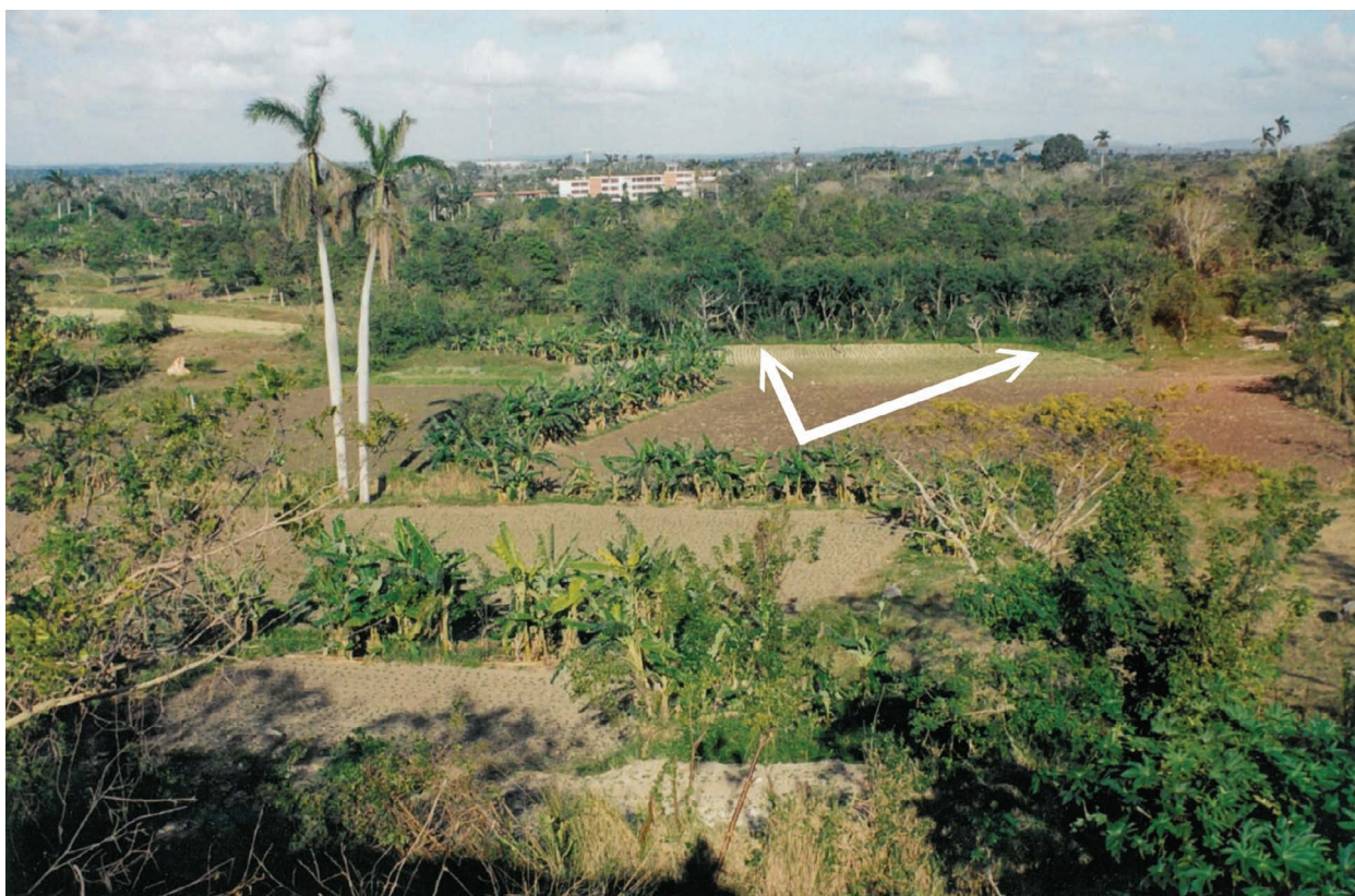
Fig. 2. General view of the habitat in the vicinity of Santa Clara, Cuba. The Carystoides was collected along the edge of the forest indicated by the arrows.

relative to species differences. For these reasons, species determinations in the genus are difficult and subject to interpretation.