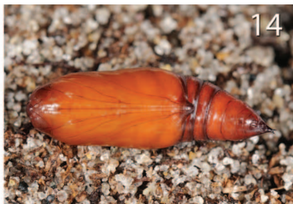
FIGS. 13-14. 13) Hadena ectypa , pupa, lateral. Length 16 mm, width 5.0 mm at third abdominal segment. Photographed 20 August 2009. 14) Hadena ectypa , pupa, ventral. Length 15 mm, width 5.0 mm at third abdominal segment. Photographed 7 August 2010.