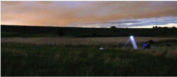
FIG. 3. The author using one of the frame assemblies to collect Lepidoptera in Colorado.