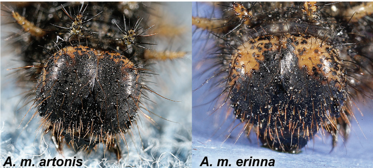
FIG. 4. Head capsules of sixth instar Argynnis mormonia artonis (Steens Mountain, OR) and A. m. erinna (Mount Howard, OR).