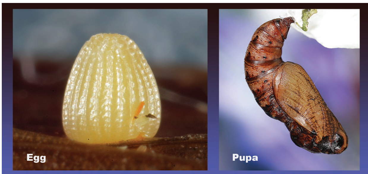
FIG. 1. Egg and pupa of Argynnis mormonia artonis from Steens Mountain, Oregon.