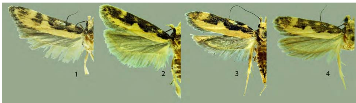
FIGS. 1–4. Chionodes hodgesorum adults; 1. male holotype (Genitalia on slide USNM 144565); 2. female paratype; 3. male paratype; 4. female paratype.

eyepiece of a Wild™ model M5 stereo-microscope at magnification of 6x.