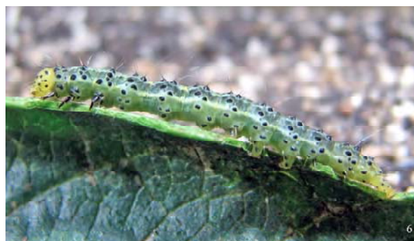
Fig. 6. Live Hypena opulenta larva

Larva. (Figs 6 & 7) Fully grown larvae are 14 to 22 mm in length, green (Fig. 6) and with all major setae of head and body with dark well defined setal bases except those of SV2 of abdominal segments 5 and 6 (Fig. 7).