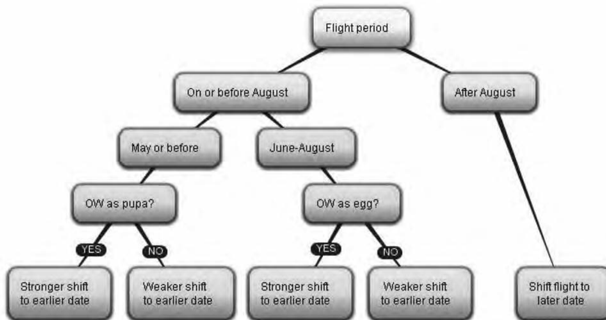
FIG. 1: Potential phenological responses based on adult flight period and overwintering stage. See text for description of studies used.

2012). A number of studies have shown that these characteristics have also been associated with a higher level of vulnerability specifically to climate change (Betzholtz & Franzen 2011, Franzén & Betzholtz 2012; but see Arribas et al. 2012). In addition to declines in numbers, that vulnerability may express itself in range shifts and phenological changes.