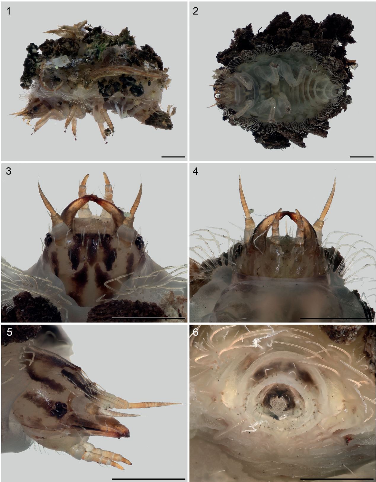
Figs. 1–6. Italochrysa italica (Rossi), morphology of live 3rd instar. – 1. Habitus, lateral view (with debris packet). 2. Habitus, ventral view. 3. Head capsule, dorsal view. 4. Head capsule, ventral view. 5. Head capsule, lateral view. 6. Pygopodium. Scale bars: 1 mm.