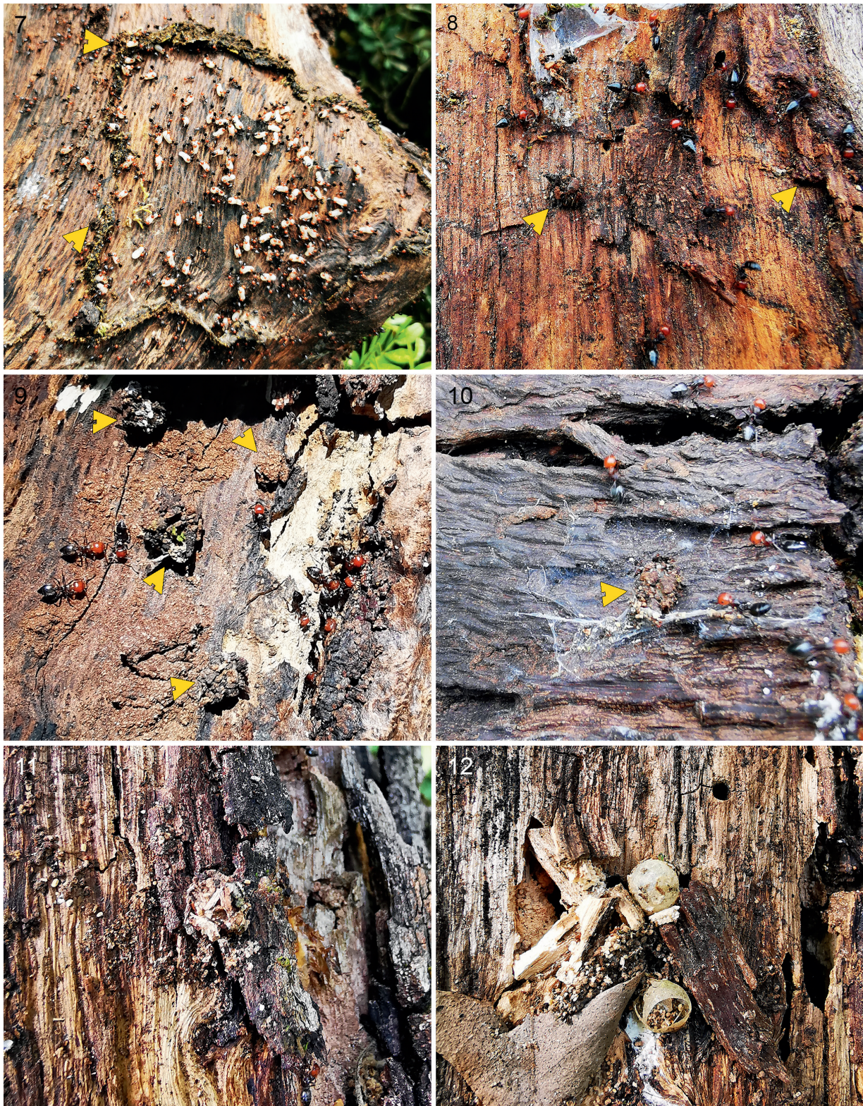
Figs. 7–12. Italo-chrysa italica (Rossi) larvae in nature, within nests of Crematogaster scutellaris (Olivier). – 7. Brood chamber of ant nest 1. 8. Two larvae in nest 1. 9. Four larvae resting in proximity of nest 2. 10. Larva moving away from ant workers. 11. Larva with debris packet made of wood fragments. 12. Old empty pupal cocoons of I. italica in nest 3. Yellow arrows indicate camouflaged chrysopid larvae.