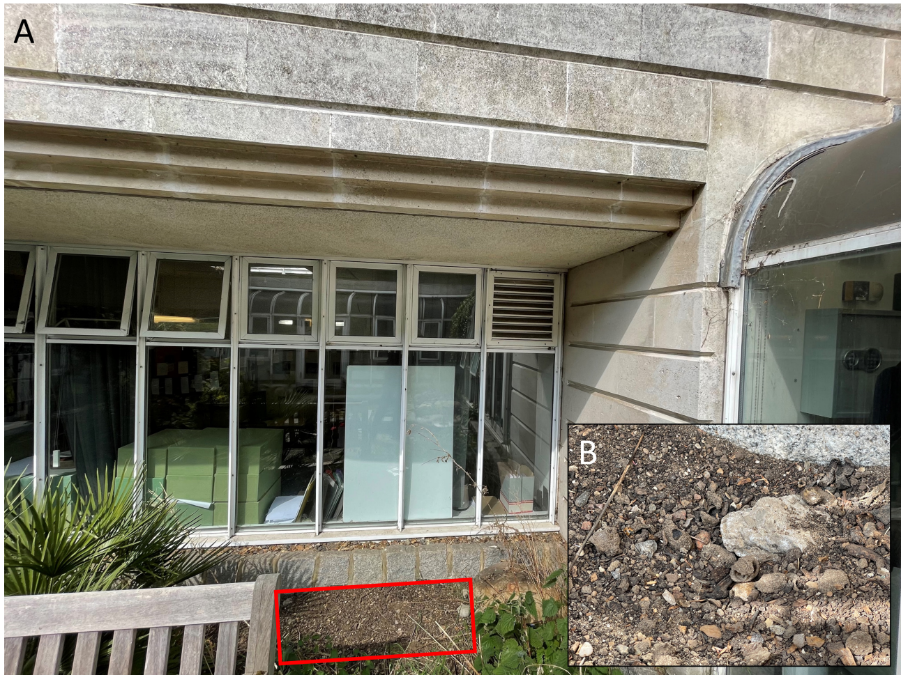
Fig. 2. Site B, Kew Gardens, London, UK. A. Overall site, with the visible area used for nesting outlined in red. B. Empty nest cells from previous years.