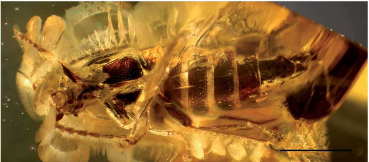
Fig. 2. Mantimalthinus balticus gen. et sp. nov., Baltic amber. Holotype, ventral view. Bar = 1.0 mm.

H o l o t y p e : Probably male, specimen included in Baltic amber, ARTUR R. MICHALSKI leg. , deposited at the Museo Civico