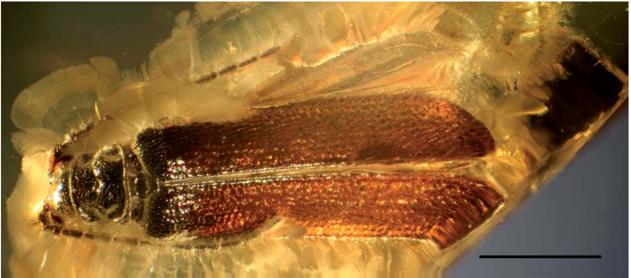
Fig. 1. Mantimalthinus balticus gen. et sp. nov., Baltic amber. Holotype, dorsal view. Bar = 1.0 mm.

maxillary palps unequal in length with the last segment globular and with pointed apex. The combination of distinctive characters of the new genus is as follows: head rounded back to the eyes and equipped by sparse punctation; pronotum transverse strongly bordered at the hind margin, in particular at the angles; elytra long, wrinkled, without impressed punctuation and without traces of ridges, leaving uncovered only the last urite (which appears like a caudal appendix); metacoxae not elongated; tibial spurs absent; trochanter III very elongated (in all other genera is rounded or rounded with narrow and short lobe stretched backwards). The combination of these characters is not present in any known genus. Only Malthinellus malickyi WITTMER, 1997, of