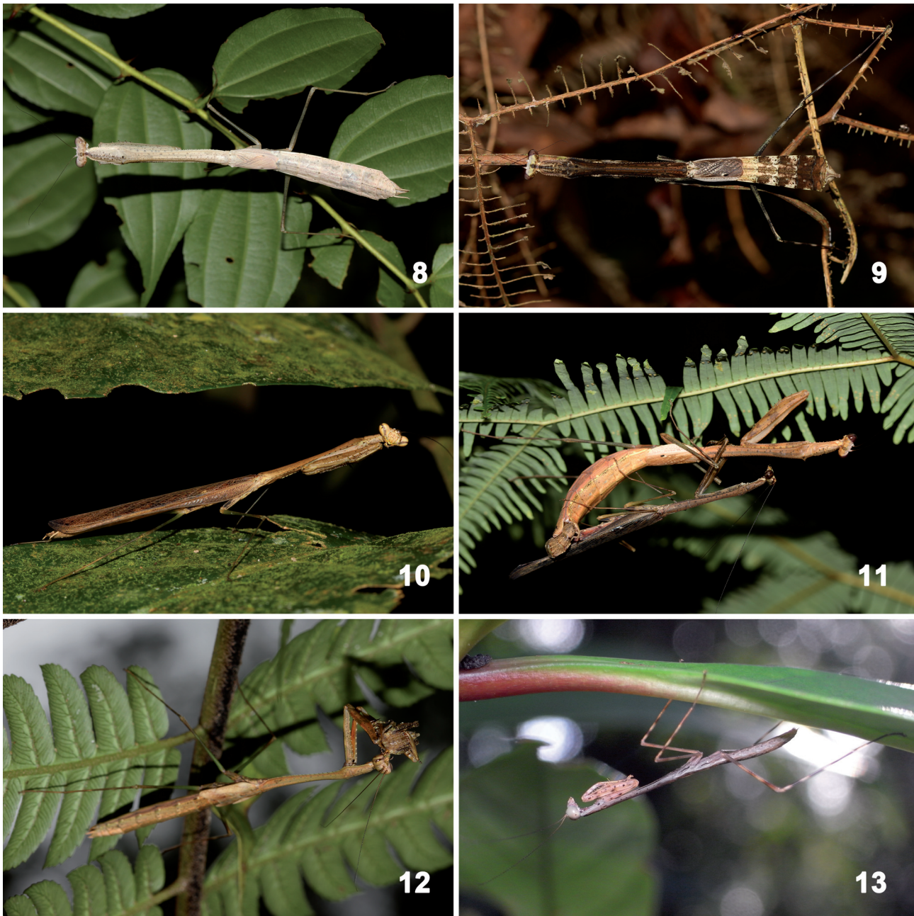
Figs. 8–13. Tagalomantis manillensis , life appearance. – 8. Light-colored ♀ without patterning. 9. Disruptively mottled ♀ (note oblique markings on pronotum). 10. Adult ♂ (note greenish walking legs). 11. Pair in copula. 12. Subadult ♂ eating tetrigid orthopteran. 13. Second instar nymph.

same habitat, which used to arrive between 20.30 and 21.30 h (e. g. Amantis aeta Hebard, 1920, Haania sp., Lep-tomantella lactea [Saussure, 1870], Hierodula sp.).