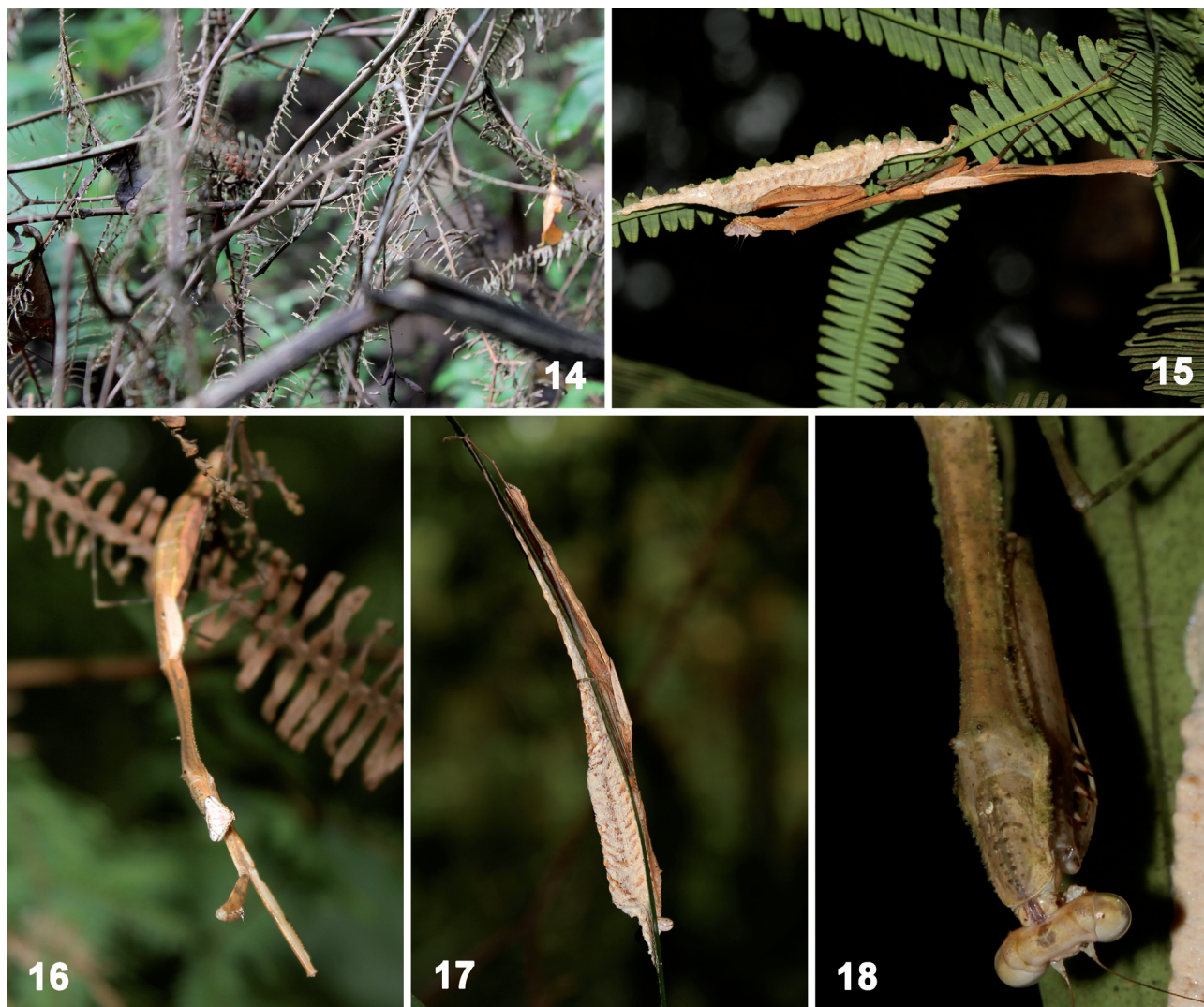
Figs. 14–18. Tagalomantis manillensis , life history aspects. – 14. ♀ (at center) camouflaged among dry bracken fronds. 15. ♀ in stick attitude (type I) (note protracted fore and mid legs and flattened abdomen). 16. ♀ in stick attitude (type II) (note bent body and angled fore femur). 17. ♀ in stick attitude (type I) hiding behind ootheca. 18. Enlarged pronotum of ♀ showing mossy overgrowth.

Pressing against the perch: when approached by a potential threat the mantid brings its body in close proximity to the substrate it hangs on. This reduces betraying shadows and, in case of leaves as perch, visibility from above. Fore legs are closed under the body, while the position of other legs may vary. In its most expressed form, the walking legs are protracted and kept in line with the body