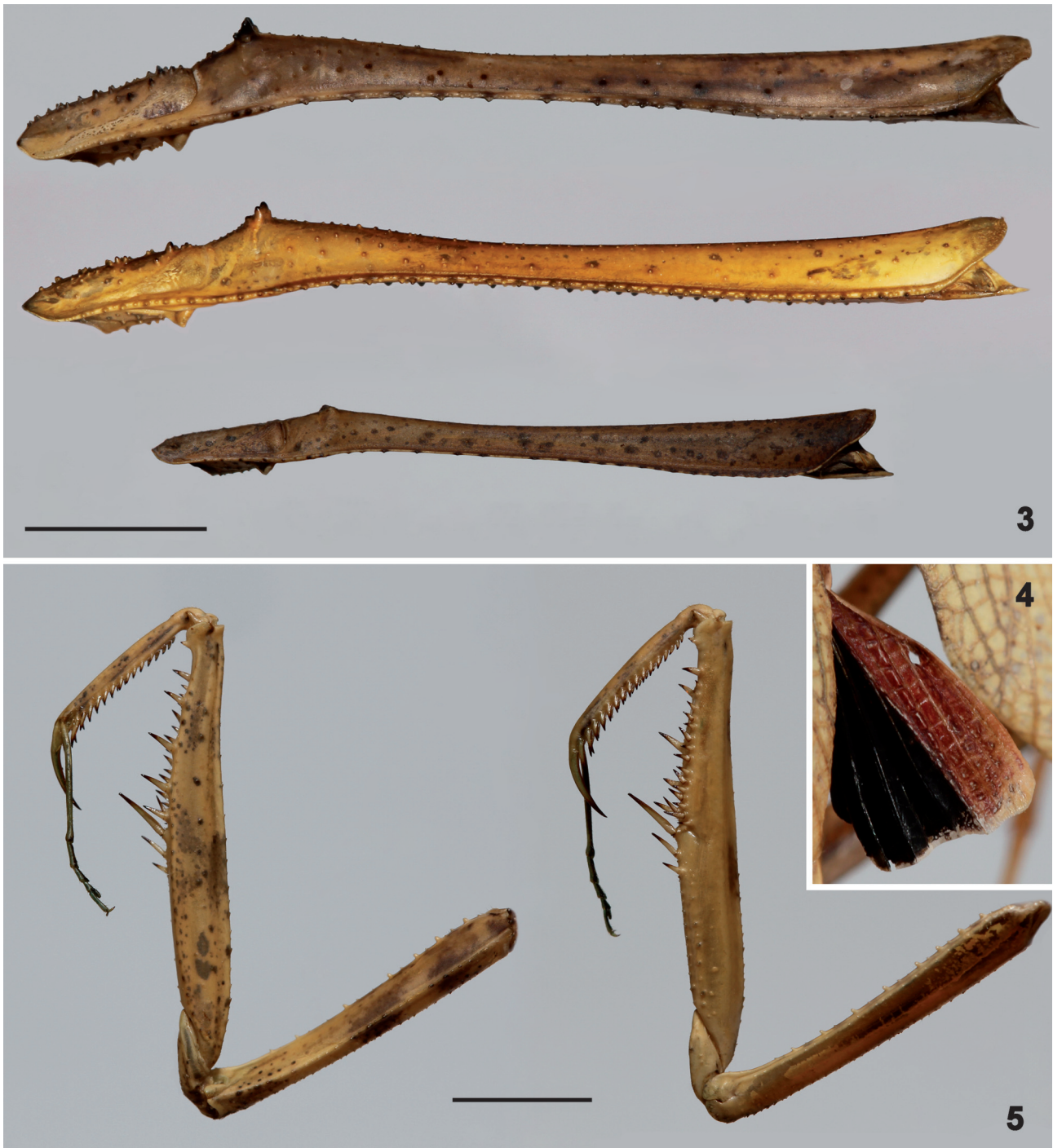
Figs. 3–5. Tagalomantis manillensis . – 3. Prothoraces of two ♀♀ (top and center) and ♂ (bottom) in lateral view. 4. Hind wing of ♀. 5. Fore leg of ♀ in posterior (left) and anterior view (right). – Scale bars: 5 mm.