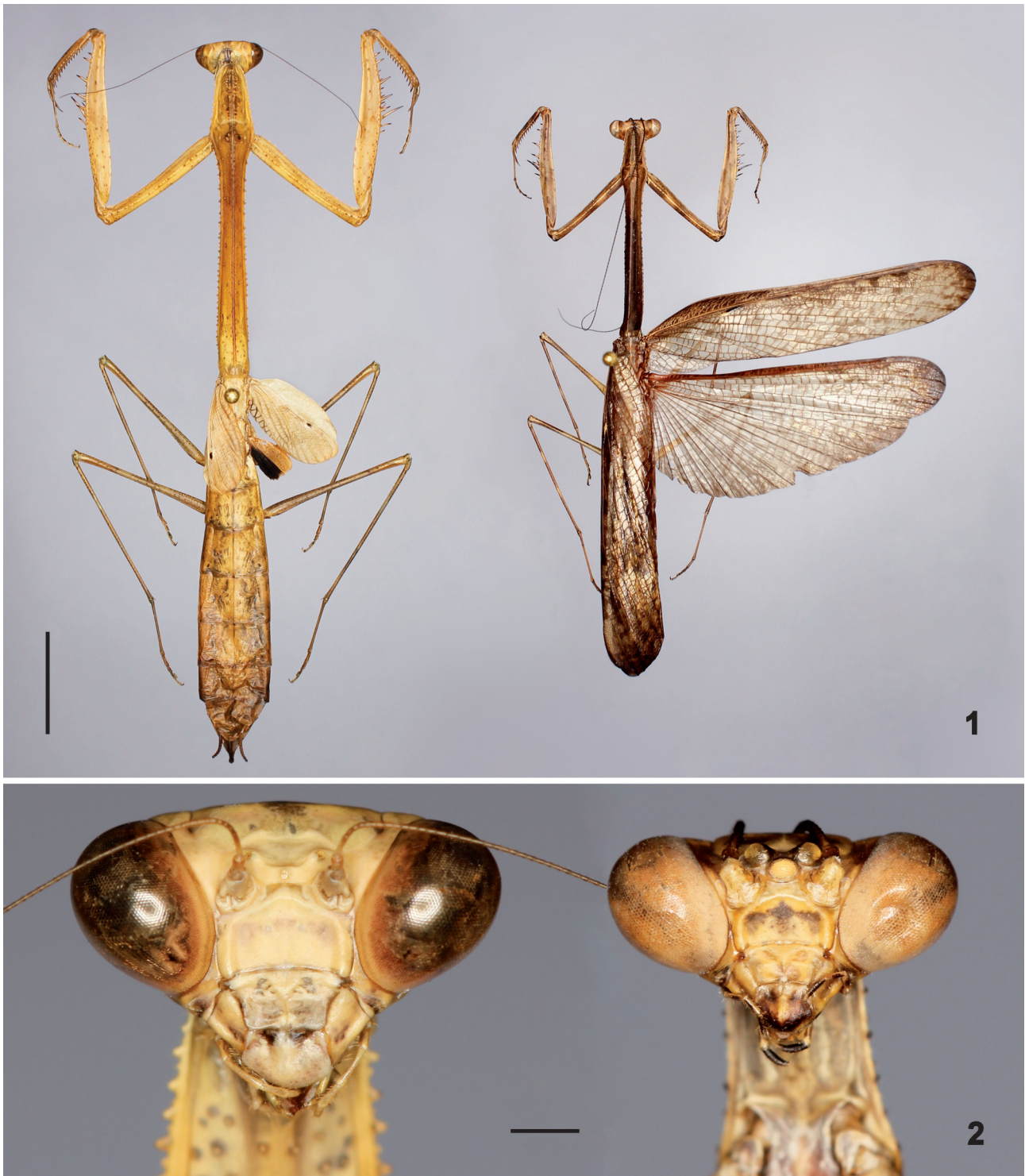
Figs. 1–2. Tagalomantis manillensis . – 1. Dorsal habitus, ♀ (left) and ♂ (right). 2. Head, anterior view, ♀ (left) and ♂ (right). – Scale bars: 10 mm (1), 1 mm (2)