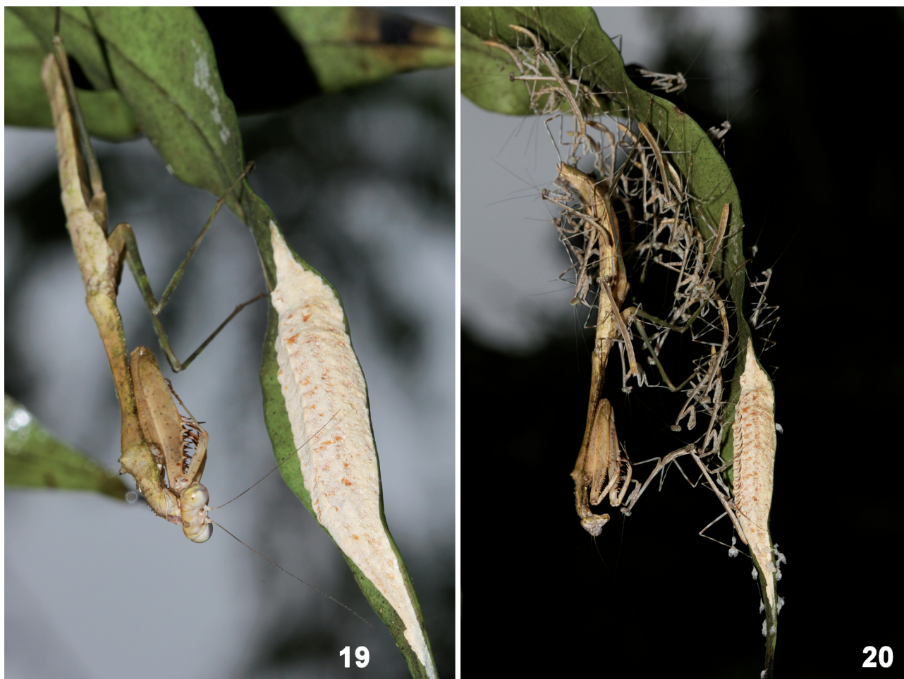
Figs. 19–20. Tagalomantis manillensis , brood care. – 19. Egg-guarding posture (note position of antennae and mossy overgrowth on cuticle). 20. Same ♀ after emerging of nymphs.

axis. While the mid legs are bent forward, the hind legs are outstretched backwards. This represents one of two types of full stick attitudes.