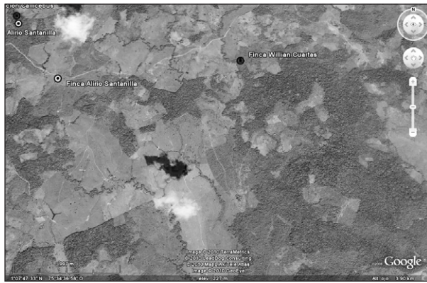
Figure 2. 75-km 2 quadrat analyzed for fragmentation and percent of forest cover (Image Google Earth, 2003).