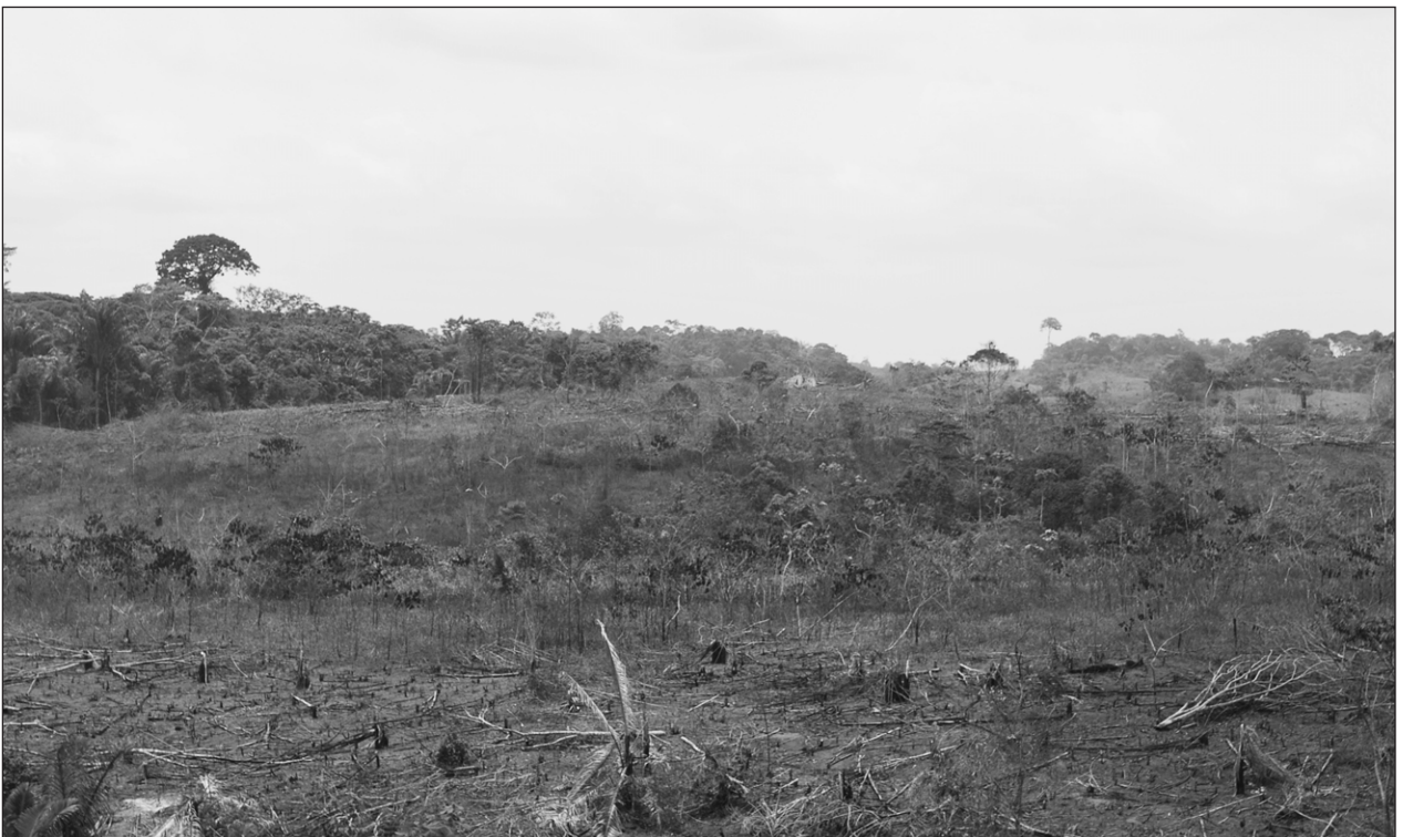
Figure 4. Pasture cut from former study forest.

In 2001, more than 50% of the territory of nine municipalities of Caquetá had been converted to grassland. Our calculation based on satellite images (2003) of 75 km 2 of land near Valparaiso yielded a conversion of 68%.