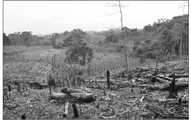
Figure 7. Coca plantation in a forest fragment.

For the reasons above, we recommend that this species be classified as Critically Endangered (CR) on the IUCN Red List of Threatened Species applying a number of criteria. We believe that there has been a population reduction of more 80% in the last 10 years or three generations due to a reduction of the area of occupation, and the causes of the reduction have certainly not stopped, and they are affected by introduced taxa and contaminants