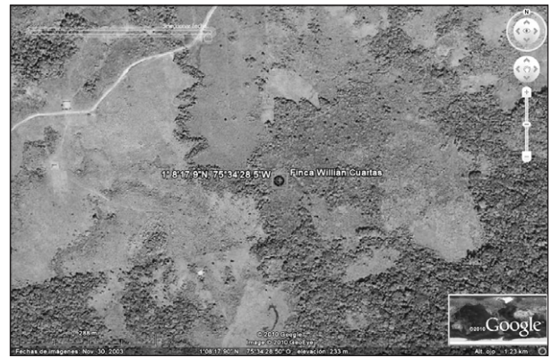
Figure 3. Area around the Hacienda William Cuartas (4 km × 2.75 km) showing ongoing fragmentation. (Image Google Earth, 2003).

extremely fragmented. Local people confirm that C. caquetensis eats Mauritia flexuosa fruits, just as has been observed for Callicebus torquatus lugens by Palacios et al. (1997) and Callicebus t. lucifer by TRD (unpubl. data).