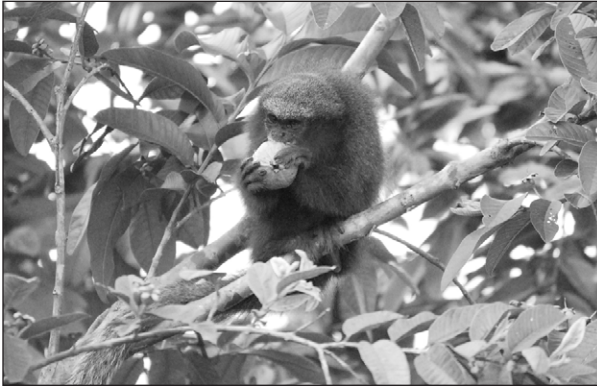
Figure 6. Callicebus caquetensis eating a guava fruit. (Photo by Javier García).

been evaluated in terms of its damage to arboreal fauna such as titi monkeys. Genotoxic, hormonal, and enzymatic effects of glyphosate in mammals have been reported, nevertheless (Lioi et al. , 1998; Peluso et al. , 1998; Daruich et al. , 2001). In rats, glyphosate has been found to decrease the activity of some detoxifying enzymes, cytochrome P-450, and monooxygenase activities and the intestinal activity of aryl hydrocarbon hydroxylase when injected into the abdomen (Hietanen et al. , 1983). The fact that this primate depends on vegetation that may often be sprayed with glyphosate around coca fields means that the animals are subjected to yet another environmental assault, which has never been evaluated—die-back of a part of their habitat due to spraying, the ingestion of affected fruits, or even being directly coated by the herbicide.