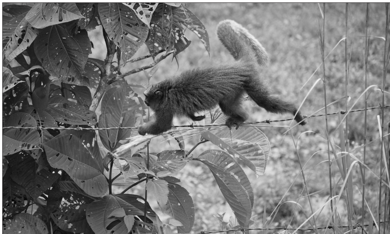
Figure 5. Callicebus caquetensis negotiating barbed wire fence between two fragments. (Photo by Javier García).

Herbicide is known to affect aquatic habitats and to cause malformation of tadpoles (Giesy, 2000; Chivian & Bernstein, 2008). Continuing fumigation of illegal crops with glyphosate causes environmental pollution and has never