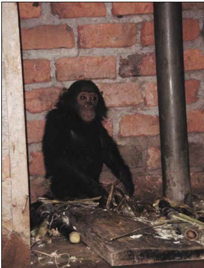
Figure 3. Captured chimpanzee in Kiseke village, Kitoba Subcounty, October 2006.

Case 2. During surveys along the Waki River, local people reported that chimpanzees were often found in a valley inside Kasongore FR, known as Kalyango. There are permanent villages in this reserve, and most suitable land is cultivated. The 'main forest' was an approximately 2–3 ha patch of degraded forest on a slope, which contained a concentration of nests. Adjacent to this patch an area equivalent in size had recently been burnt and cleared for farming. Elsewhere, gallery forest had been cut down. Residents claimed the National