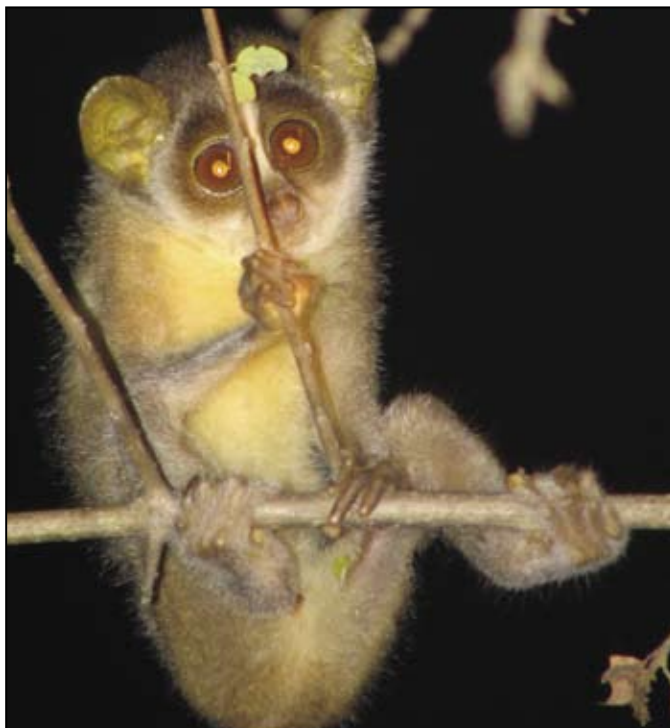
Figure 3. A young Loris lydekkerianus nordicus from Wilpattu National Park, Sri Lanka.

of collection unknown), from Monaragala and Badalkumbura (Jenkins 1987). During early surveys, Phillips recorded the strange, shrill cry of a loris without a confirmed sighting in Marai villu of Wilpattu National Park (Phillips 1933).