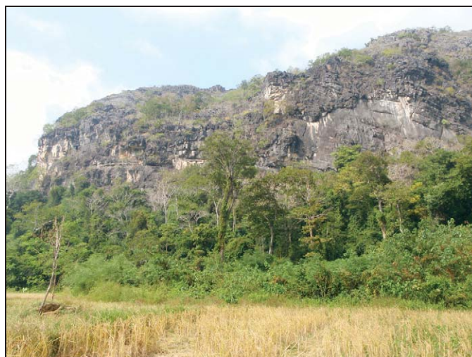
Figure 2. Pha Lom, north-east Savannakhet province, Lao PDR, 14 November 2008. A small ( c. 800 m long × 250 m wide), isolated karst amid agriculture and degraded plains forest. In this landscape, Assamese macaques have been recorded only on the karsts.

The paucity of solid records (of any macaque species) from the northern highlands fits a general tendency for hunting-sensitive diurnal quarry species to be found much less often during direct survey there compared with areas in and south of the Nam Kading catchment (Fuchs et al. 2007; Duckworth 2008; Timmins and Duckworth 2008). This reflects differing