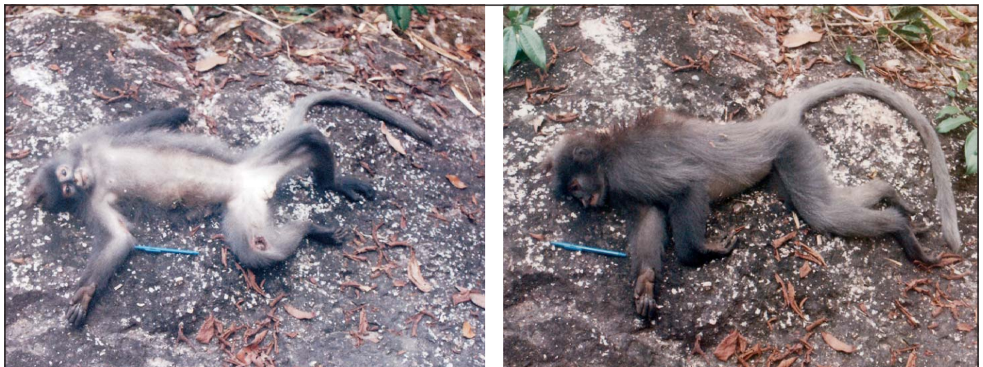
Figure 5. Recently shot Phayre's leaf monkey Trachypithecus phayrei , Lower Nam Ngiap catchment, Lao PDR, 17 February 1999.

No Lao Phayre's leaf monkey record with habitat information comes from deep within extensive closed-canopy forest. Instead, records are from forests with broken canopy and extensive tall bamboo, such features perhaps resulting from human land-use ancient or recent, underlain by geological