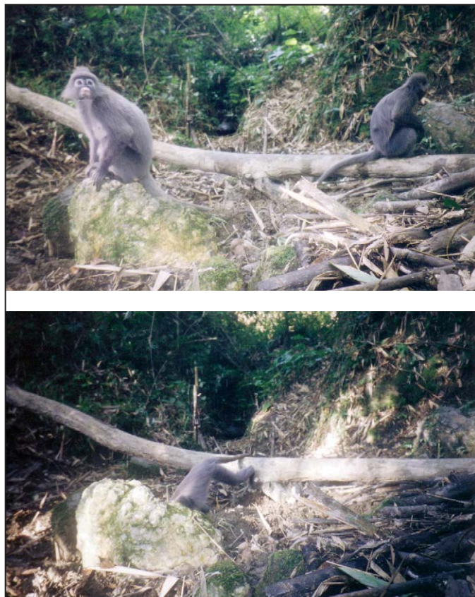
Figure 2. Phayre's leaf monkeys Trachypithecus phayrei at a mineral lick in Nam Et–Phou Louey National Protected Area, Lao PDR, 18 January 2005. (above) two animals resting; (below) one animal eating or drinking.

Objective identification of Lao sightings of gray leaf monkeys as Phayre's leaf monkey needs care, because another gray species, Indochinese silvered leaf monkey T. germaini (also of disputed taxonomy), inhabits the country. There are too few Lao specimens of gray leaf monkeys to define even the coarse ranges of both these species (Table 1; also, Timmins et al. 2011). Although the two are readily separated with good views and careful observation, monkeys recorded