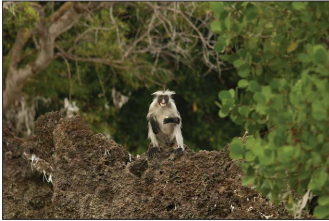
Figure 3. Adult male Zanzibar red colobus Procolobus kirkii eating mangrove flowers on coral rag, southern Uzi Island, Zanzibar Archipelago, Tanzania.

tended to be associated with lower numbers of monkey sightings, with an exception in Uzi, where Sykes's monkey and human encounter rates tended to correlate, suggesting their use of relatively disturbed forest at this site (Table 2).