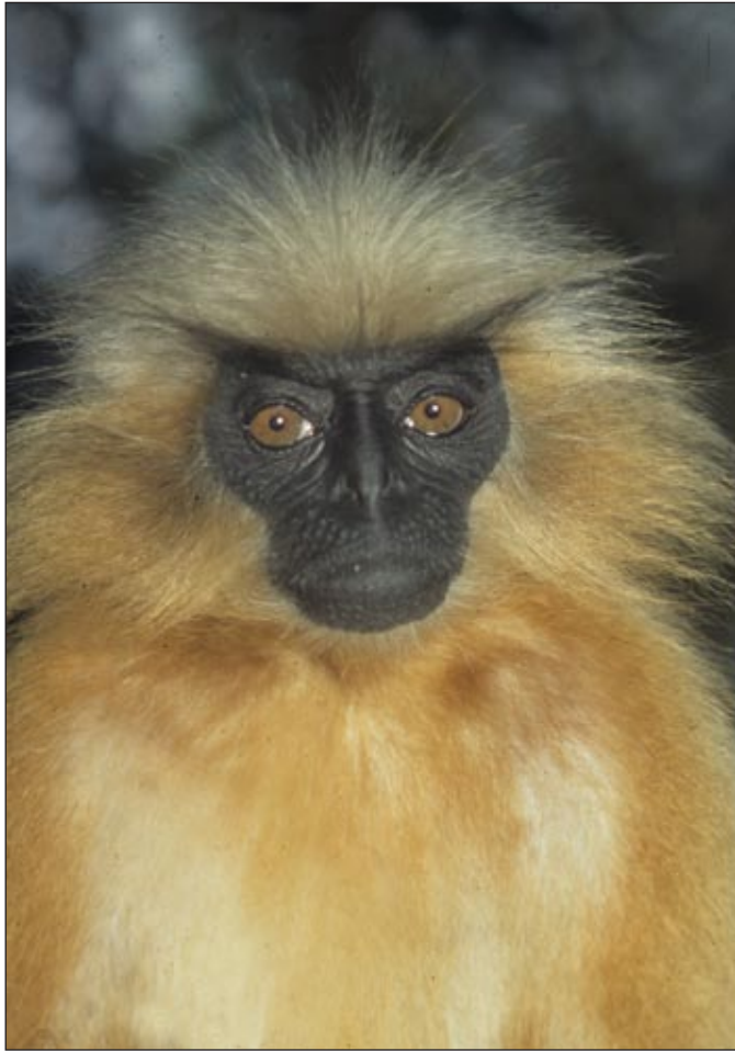
Figure 2. Golden langur, Trachypithecus geei .

Using the 1997 survey, Srivastava et al. (2001b) suggested a “sink effect” for the golden langur populations inhabiting these reserves. The populations are restricted to a small area due to the loss of suitable habitat. The authors also demonstrated that populations in undisturbed habitats live in smaller groups with lower population densities, and populations in disturbed habitats live in larger groups with higher densities because food is more clumped and unevenly distributed within the habitat. A similar trend was found in this study, providing further support for the idea that the disturbed habitats will ultimately erode, as in the case of Ripu Reserve Forest. There the individual and group densities were higher during 1997 surveys. The langurs have declined drastically, from 6.2 groups and 46.5 individuals to 2.8 groups and 25.8 individuals per km 2 in 2001 (Table 3). Srivastava et al. (2001b) also suggested that higher densities generate a higher probability of disease and pathogen spread, as in the case of zoo and captive animals. Nevertheless, it is unclear why the group and individual densities have increased for Chirrang and Manas reserve forests, even though the habitats have degraded during this period (for details see Tables 4 and 5). The only explanation we can offer at this time is that the populations have either moved from Ripu Reserve Forest to these