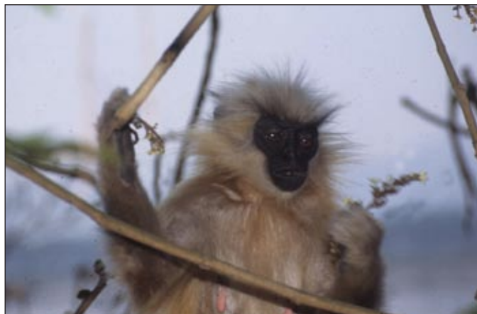
Figure 3. Golden langur, Trachypitecus geei .