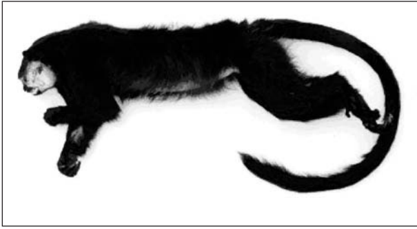
Figure 2. Adult male of Saguinus inustus killed by local inhabitants of the Amanã State Sustainable Development Reserve, Amazonas.