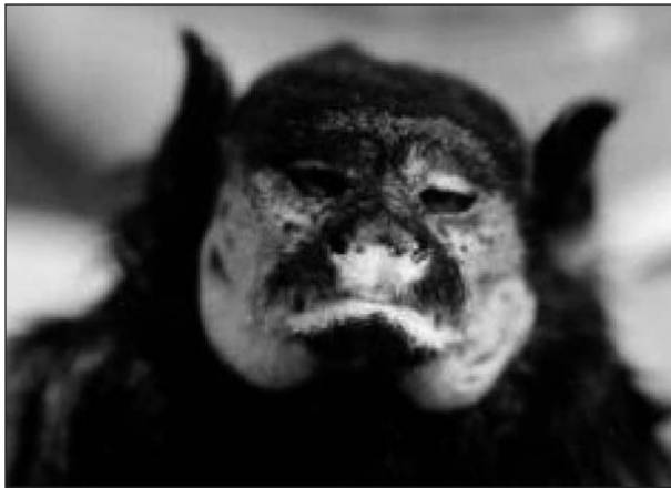
Figure 3. The mottled face of Saguinus inustus .