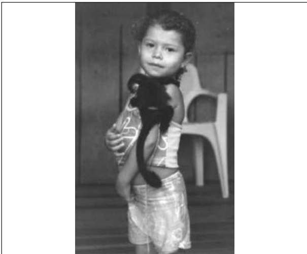
Figure 4. A juvenile pet S. inustus .

that may occur in the area but have not been recorded there to date are members of the genera Pithecia , Ateles and Lagothrix .