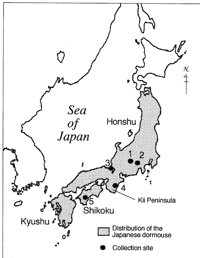
Fig. 1. Geographic distribution of the Japanese dormouse. Numbers refer to the collection sites of the dormice listed in Table 1.

Wahlet et al. , 1993). At present, there are three independent notions (Holden, 1993; Wahlet et al. , 1993) as follows. Glirulus and related fossil genera belong to a unique subfamily Glirulinae, independent of the seven other well-defined subfamilies of Myoxidae; they belong to the subfamily Dromyinae which is represented by the genus Dryomys , or they belong to the subfamily Myoxinae which is represented by the genus Muscardinus .