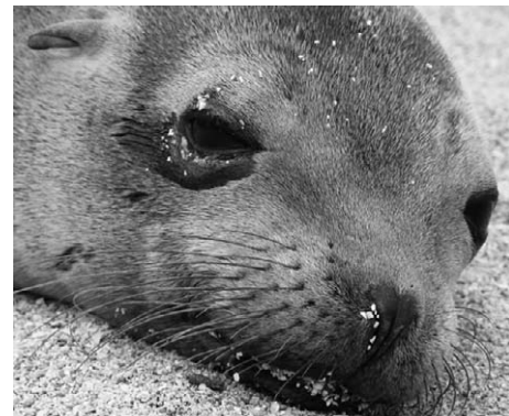
Fig. 1. A close-up picture of a sea lion ( Zalophus wollebaeki ) reveals a dense matrix of vibrissae. These tactile end-organs function to detect particles and vortices in the underwater environment.

Qualitative differences between the whiskers of sea lions and seals may explain variations in the animals' performance. Miersch et al. (2011) isolated single whiskers of both animals and tested the whiskers' response to underwater wakes. For both types of whiskers the researchers cal-