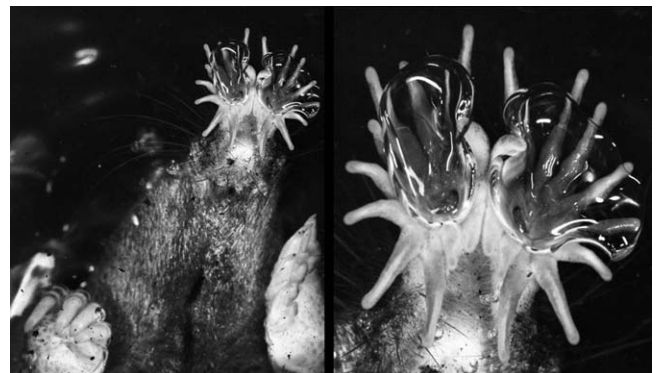
Fig. 3. The star-nosed mole's unique somatosensory organ, composed of 11 pairs of fleshy appendages for tactile perception. The image on the left features the star-nosed mole ( Condylura cristata ) in the midst of an underwater sniff, with bubbles being re-inhaled by the nose. The image on the right zooms in on the nose and the air bubble.

The star-nosed mole is recognized for its ornate soma-