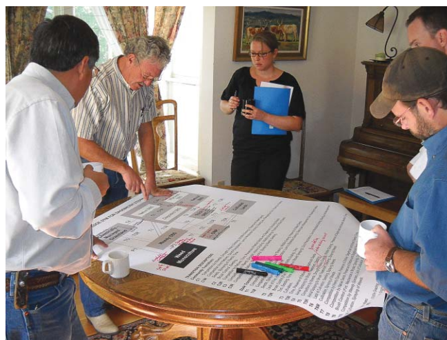
Figure 1. A group evaluating a state-and-transition model at a workshop.

Focus groups are small groups of 6–15 people who are invited to have an informal, semistructured conversation about a subject of interest. It is best to hold separate focus groups for different types of participants with similar backgrounds (e.g., ranchers, conservationists) so that the participants feel free to share information and opinions. Focus groups are an efficient way to gather a lot of information from a relatively large number of people in a short amount of time. Similar to an interview, the focus group discussion is guided by a list of open-ended questions. The group setting allows people to answer each question from their personal perspective, but also respond to and interact with the other participants. As in a workshop, the interactive aspect of focus groups can lead to insights that would not emerge otherwise. Focus groups could be used to develop a draft model, brainstorm an inventory of states, transitions, time scales, and indicators, or provide feedback on an existing model (Fig. 1). They are one of the most rapid of elicitation techniques, but take longer to prepare for than asking for feedback or interviewing individuals. A focus group requires a facilitator and another person to take notes. As with an interview, we strongly recommend audio-recording the focus group for accurate and complete documentation.