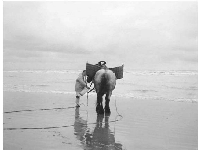
Figure 8. Shrimp fisherman mounting his horse after baskets have been fitted to wooden saddle; chains are attached to the 'net'.

metres long that slides over the sand and lifts the shrimps into the net. Mules were preferred but have disappeared from the scene. The nets are kept open horizontally by two side boards, a chain drags on the sand, and floaters keep the upper side of the