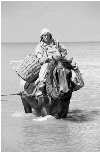
Figure 11. Heading back for shore.