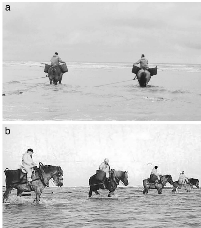
Figure 9. (a) Horses enter the water to their underbelly. (b) Group fishing.

metres long that slides over the sand and lifts the shrimps into the net. Mules were preferred but have disappeared from the scene. The nets are kept open horizontally by two side boards, a chain drags on the sand, and floaters keep the upper side of the