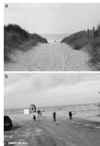
Figure 5. (a) Oostduinkerke. Schipgat former inlet. (b) Fig. 5b Schipgat (literal translation: ship's hole) access to the sea (Note: Metal structure in far background is work of art that has no relation to former function of the sea inlet nor to current access path of shrimp fishermen to beach and surf).

The economy of the Flanders' maritime plain has, however, undergone major changes in the historical period. Hardly is one aware today that Flemings of the sleepy resort of Wenduine, which prided itself as Princess-of-Beaches resort, were once reputable whale hunters whose tradition lives on in the 'Flemish Islands', now called the Azores (Charlier, 2004a)? It is equally difficult to visualize most of the generous dozen of towns lined up along the coast as fishing communities and, except for three or four among them, all stranding 6 harbours. Gone are the boats carrying initials C, O, B, W, etc. Gone too are the narrow houses huddled behind the protective sea dikes (Van Bladel, 1930). Gone even are the fancy Victorian-type sea promenade villas—occasionally referred to as Art Nouveau or Belle Époque—that Nazi-occupation forces cemented together during WW II (1940–1945) to form part of the 'impregnable' Atlantik-Wall . Wiped out for as long as a