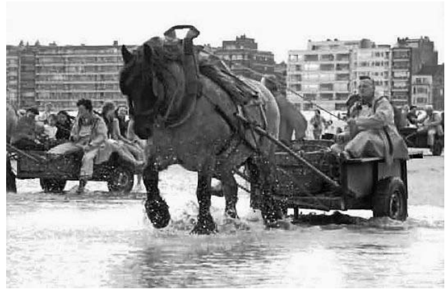
Figure 13. Horses and fishermen providing joy ride on their day off to small and big (Photo Koksijde Tourist Office).

The shrimps are gathered in the baskets, the net is washed out, the cart hooked on, and the trip ‘back home’ started (Figures 11 and 12). There, the hard-worked horse is fed oats. The catch is washed again, sand is removed as much as possible before the shrimp are thrown in the broiling brine. Once boiled, the shrimps are no longer grey or brown, but red. The brine is poured off, and the small prawns are ready for the market.