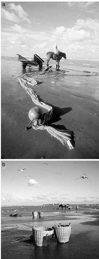
Figure 12. Gathering tools and catch.

Overfishing of the crustacean—not just locally—has rendered this type of fishing hardly profitable, and the second stage of the process—cooking in vats or drums—is done at the fisherman’s home in a brine of his own concoction; it is part of the ‘show’ only in the peak tourist season (July–August). Crangon crangon (Figure 14) is Noordzeegarnaal to the Flemings and Crevette de la mer du Nord or crevette grise [from the original Picard language word chevrette ] to the French. Why grey shrimp is known to the Anglophones (who often designate the crustacean as prawns) and as Brown Shrimp is unclear. But there are still more than enough grey shrimp to offer in the shore eateries the celebrated shrimp tomato (see Appendix) and the shrimp croquettes (once a ‘popular’ dish, now at premium prices) or, in the gastronomic fish restaurants the sole ostendaise (similar to the sole dieppoise of the French). 10