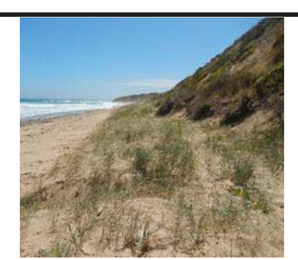
Figure 1. Thinopyrum junceiforme on the incipient dune at the base of the foredune on Thirteenth Beach, Victoria.

In Victoria, there are three main dune grass species, Ammophila arenaria (marram grass), Thinopyrum junceiforme (sea wheatgrass) (Figure 1), and Spinifex sericeus (hairy spinifex) (Cousens et al. , 2012), but only the latter is native. Marram is mainly found in the foredunes, and spinifex and sea wheatgrass dominate the incipient dunes (Cousens et al. , 2012). Sea wheatgrass is an erect, rhizomatous, perennial grass, growing to 0.5 m in height, and is endemic across a wide range of the European coasts (Hanlon and Mesgaran. 2014). It has spread rapidly along Victoria's coast since it was first recorded in 1933.