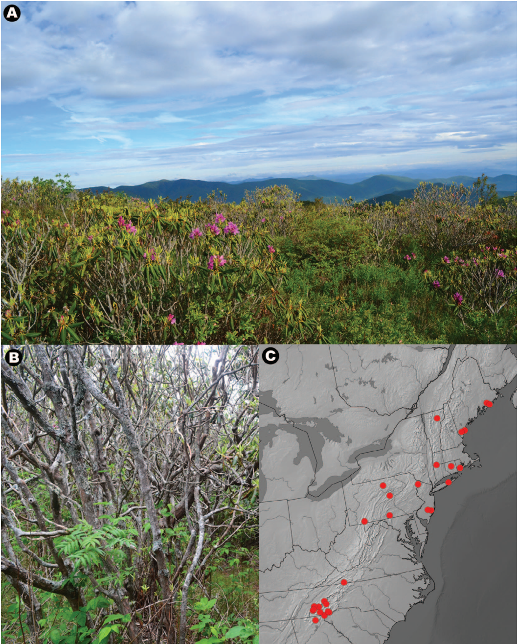
Figure 2. Ecology and distribution of Japewiella dollypartoniana . A–B, high-elevation heath balds where the species is most commonly found in the southern Appalachians. C, known distribution of the species.

The genus Japewiella was originally included within a broad concept of Japewia ; however, it was separated from that genus by Printzen (1999) based on a suite of differences in the apothecia,