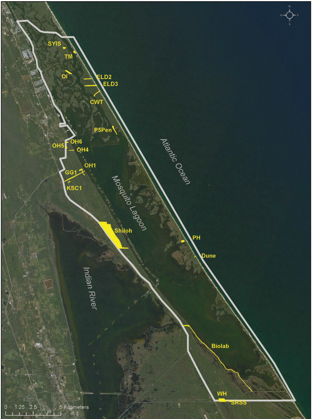
Figure 2. Location of floristic survey areas in Canaveral National Seashore. Abbreviations follow Table 1.