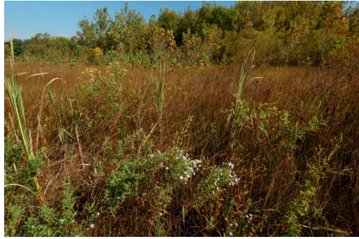
Figure 4. Calcareous wet prairie (CW) habitat type at Meadow Branch Marsh. Dominated by Scirpus pungens ; Symphyotrichum praealtum var. angustior flowering in foreground. Note invasion by Platanus occidentalis , Cornus amomum , and other native woody species in background.

Abrams Creek, and the deepest outflow of Pennypacker Spring. Diagnostic indicator species include Bidens laevis , Lemna minor , Nuphar advena , Potamogeton foliosus , Potamogeton illinoensis , and Sparganium americanum . State-rare species restricted to this habitat include Lemna trisulca (G5S1) and Sparganium emersum (G5S1). Chara sp. dominates much of the substrate of Pennypacker Spring and White's Pond. The introduced species Myriophyllum aquaticum is an aggressive invader at Pennypacker Spring. The vegetation of these habitats represents the Floodplain Pool/Pond and Semi-permanent Impoundment ecological groups of the Virginia state vegetation classification (Fleming and Patterson 2017). Much of the vegetation of the natural (nonimpounded) sloughs and channels equates to the Nuphar advena – Nymphaea odorata Aquatic Vegetation association (CEGL002386; G4G5SU) of the USNVC (Faber-Langendoen 2001).