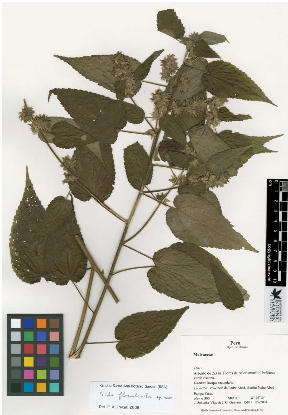
FIG. 2. Sida florulenta sp. nov. Isotype (RSA).