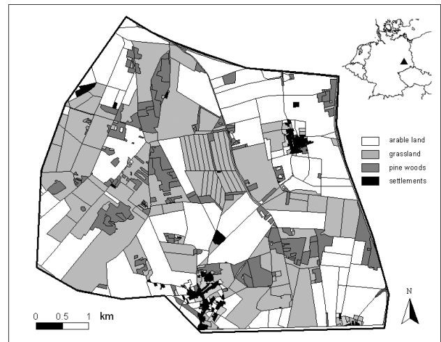
Fig. 1. Location and land-use of the study area “Lug” in eastern Germany (13°56' E, 51°37' N).

The 33 km 2 sized study area is part of the “Lug” (13°56' E, 51°37' N), a basin plain at an average 110 m a.s.l., accessible by a network of gravel roads and located in the county “Oberspreewald-Lausitz” in the southern part of the Federal State of Brandenburg in eastern Germany (Fig. 1). The central part of “Lug” is mainly used for grassland farming – both pastures and meadows – and is crossed by a network of 2 m wide drainage ditches with a total length of 91 km. For compositional analysis, pastures and meadows were merged in the category grassland. The adjoining agricultural fields (= arable land) and villages (= anthropogenic structures) are located at 115 m a.s.l. (Möckel et al. 2000). In the study area we distinguished eight main habitat categories as listed in Table 1. Farm roads, hedges and ditches are linear structures and with respect to the location error were not classified as separate habitat categories. Shallow areas of standing water are possibly frequented by raccoon dogs as foraging sites, because they offer preferred food items such as amphibians (Kauhala 1996, Sutor et al. 2010). Therefore we considered this habitat type in the compositional analysis, too. The habitat structure of the study area is typically representative of the East German agricultural landscape.