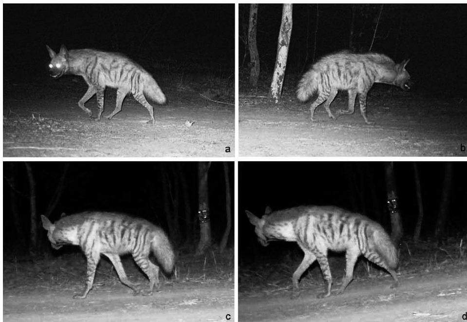
Fig. 3. The asymmetry of striped pattern on two flanks of the same striped hyena HYC-4 (a, b), and example of unambiguous identification of the same striped hyena HYC-5 (c, d).

The program CAPTURE (White et al. 1982, Rexstad & Burnham 1991) was used to analyze the capture and recaptured photograph data of striped hyenas. The survey duration was 30 days at each zone, and thus kept short in relation to expected demographic