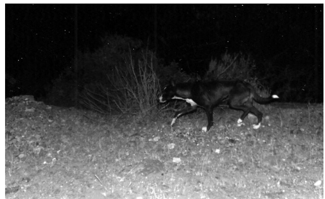
Fig. 1. Free-roaming dog in the study area.

The estate was privately-owned game land, where red deer ( Cervus elaphus ), fallow deer ( Dama dama ), and Corsico-Sardinian mouflon ( Ovis orientalis ) were introduced during the 1970's for hunting purposes. Ungulate density around the estate was high (Duarte et al. 2015): 49 to 57 red deer/km 2 , 28 to 37 fallow deer/km 2 , and 2.4 mouflon/km 2 . Deer were provided with supplementary feeding during a part of the year. Other